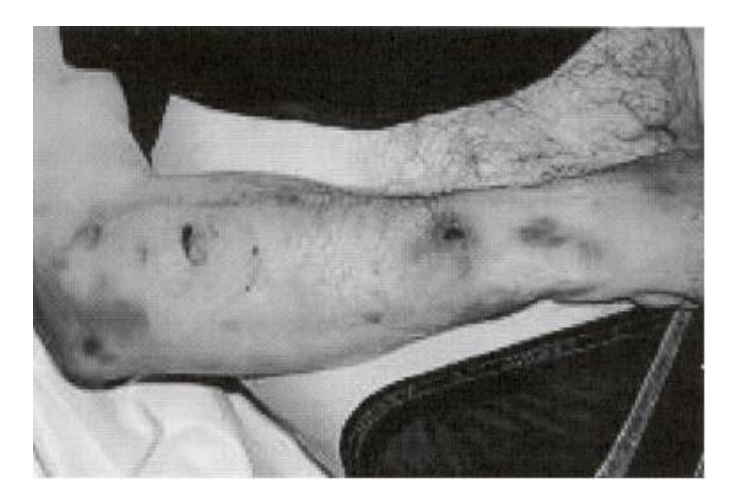
Figure B - Example of Human Bite Mark in Case of Domestic Violence

Figure A - Distribution of Injuries by Frequency of Occurrence