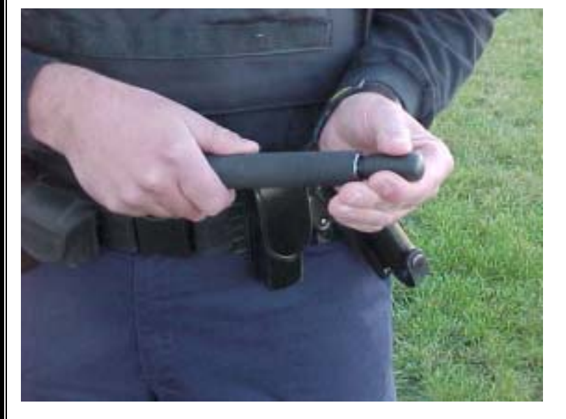
Figure #1, The autolock baton may be opened using the traditional rapid expansion or the autolock feature allows the officer to open the baton in a discrete and low profile manner using 2 hands