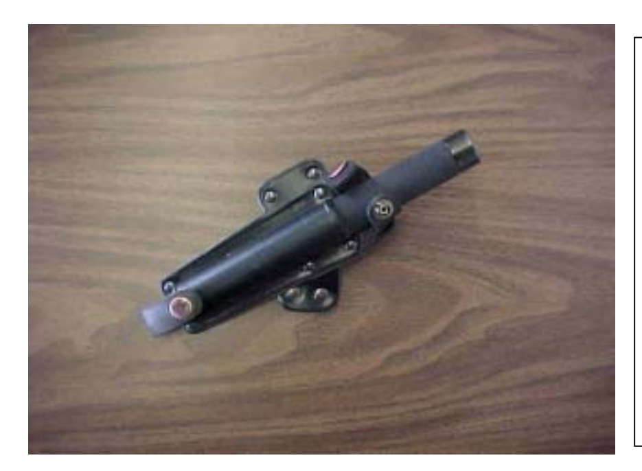
Photo of the P174 expandable Baton holder containing Monadnock 22" Autolock baton. Holder is in a canted position with the retention snap in the unsnapped mode