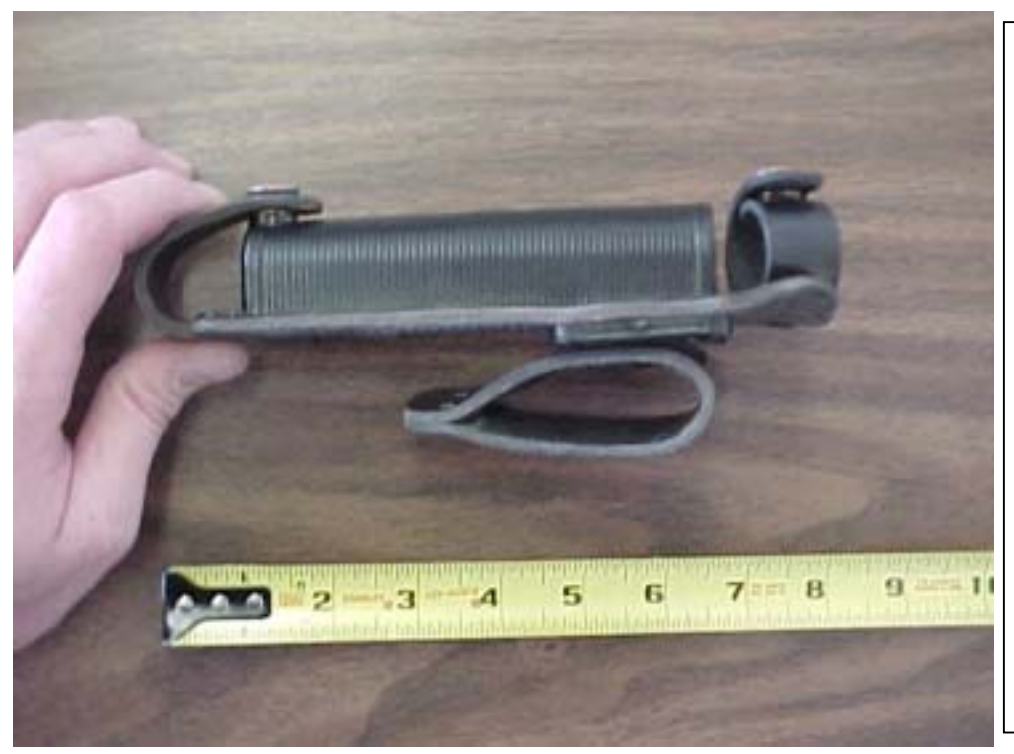
Photo shows side view of the holder. Clearly depicts belt loop, retention snaps on the top and the bottom of the holder The holder is approx. 8.5 inches

Rear view of the P174 holder. Photo shows the belt clip. This has the ability to rotate 360 Degrees