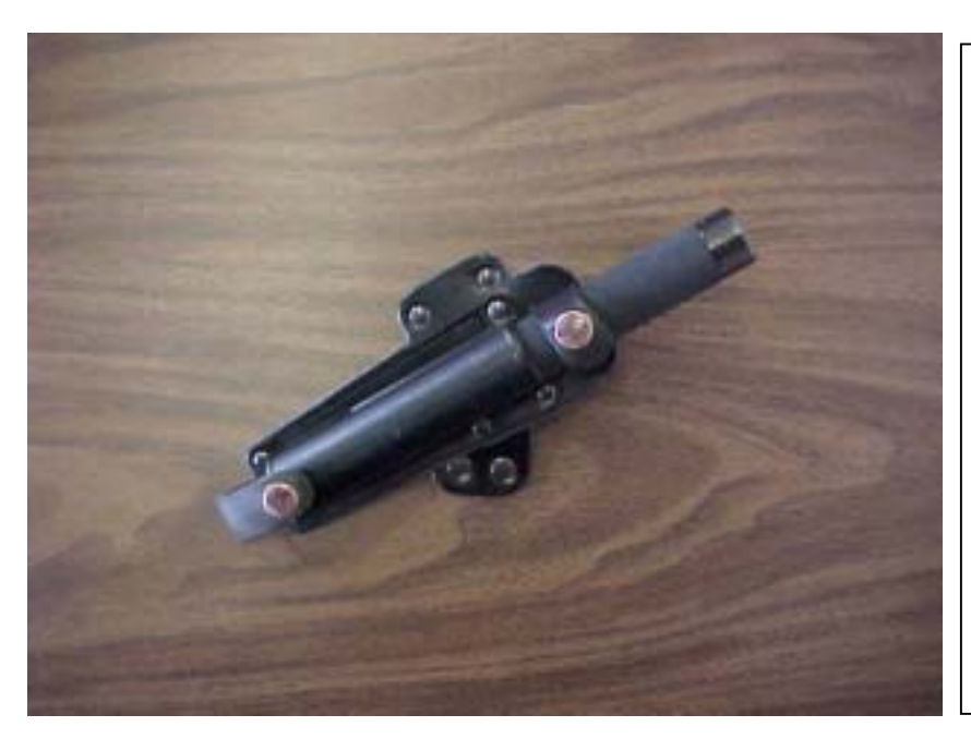
Photo shows the same baton and holder with the retention snap closed.

Photo of the P174 expandable Baton holder containing Monadnock 22" Autolock baton. Holder is in a canted position with the retention snap in the unsnapped mode