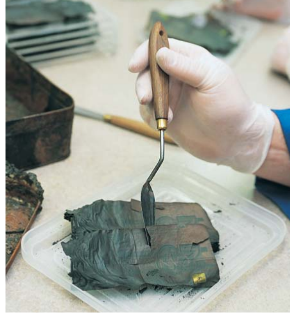
Staff in the Mutilated Note Service carefully sift through charred bank notes. Each year, the Bank is asked to identify, for reimbursement purposes, the value of notes that have been burned, decomposed, torn, shredded, or contaminated.

Bank notes have a limited lifespan. The Bank of Canada is responsible for replacing and destroying worn notes. When financial institutions return notes to the Bank, we select those that are no longer fit for circulation, shred them, and send them to landfill sites.