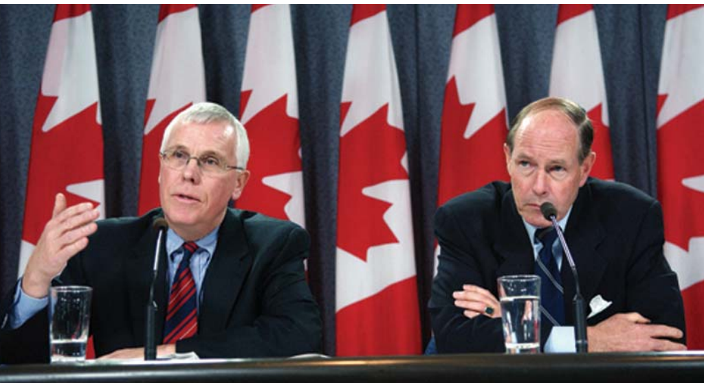
Senior Deputy Governor Paul Jenkins and Governor David Dodge at a press conference for the release of the Monetary Policy Report Update

Monetary policy decisions are made by the Bank's Governing Council, which includes the Governor, the Senior Deputy Governor, and four Deputy Governors. The strategies, policies, and economic analysis behind these decisions are explained four times a year in the Bank's Monetary Policy Report and the Update , as well as in regular speeches by members of the Council. The Bank also explains the reasons for its interest rate decisions in a press release each time it announces its target for the overnight rate.