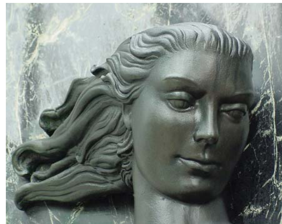
Detail of bronze panel on front of head office building

The Management Forum meets regularly to exchange information on management issues and to review corporate policy proposals. The Forum consists of the Executive Management Committee, advisers, department chiefs, and the director of human resources.