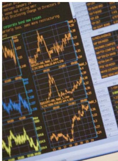
The Bank's trading room