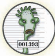
Slippery Sam Salmonella