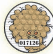
Shameless Sheila Shigella