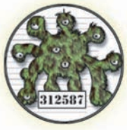
Toxic George Clostridium botulinum