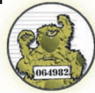
Eager Ernie E.coli 0157: H7