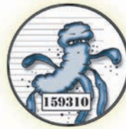
Lester the Jester Listeria monocytogenes