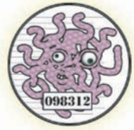
Crazy Cathy Campylobacter jejuni