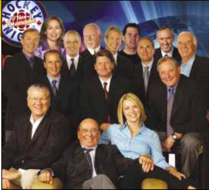
The Hockey Night in Canada Team, CBC Sports.