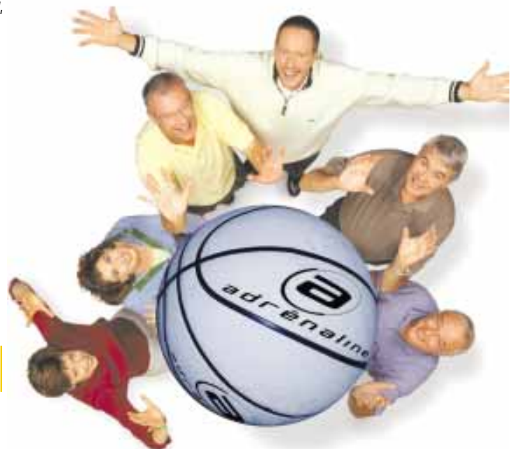
Adrenaline, French Television.