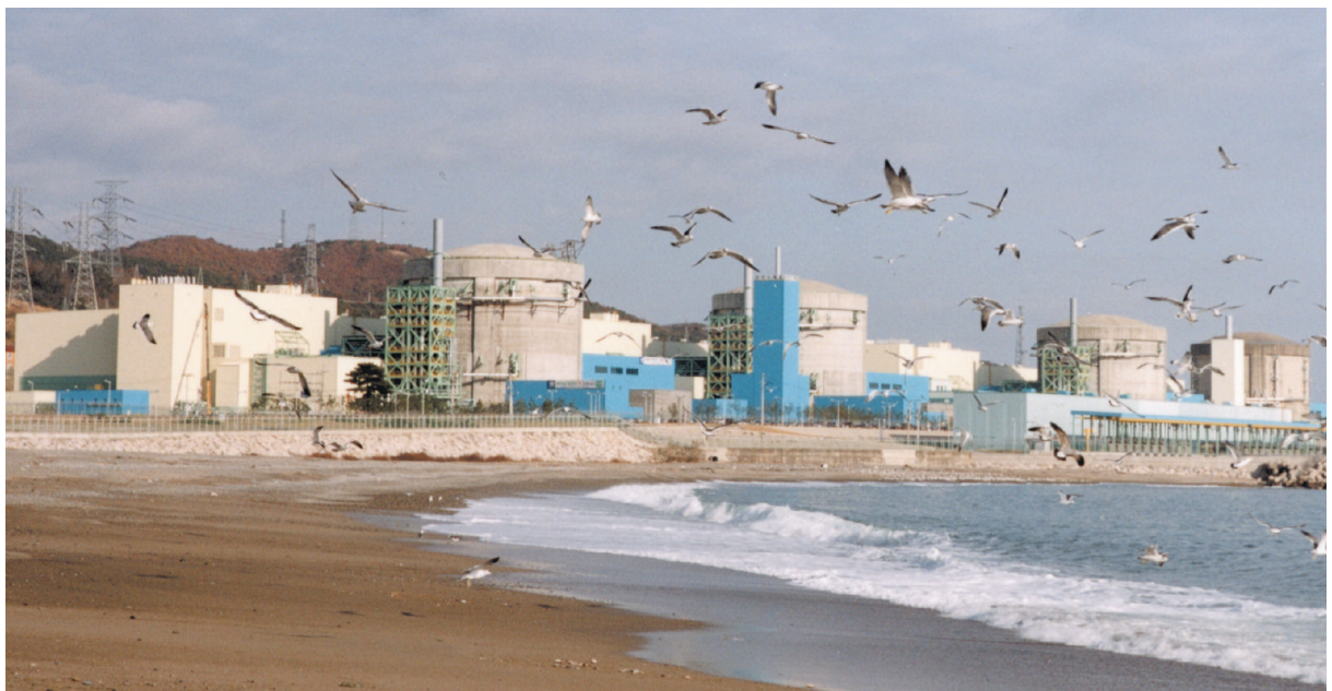
The four CANDU 6 reactors are world-top performers with a lifetime average of 85.4% for the year ending December 2000.

Source of all capacity factors is Nuclear Engineering International (NEI).