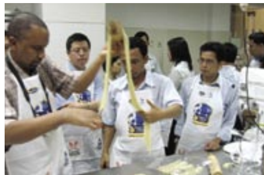
Noodle-making demonstration at the Bogasari Baking Center in Jakarta, Indonesia