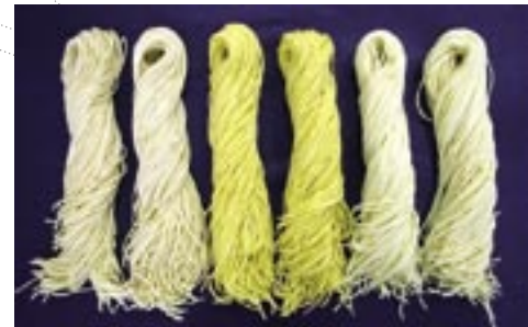
Asian noodles made from (left to right) commercial noodle flour from Asia, Canada Western Amber Durum (CWAD), and Canada Western Hard White Spring (CWHWS)

Western Canada boasts a durum-producing region of more than five million acres. It's a semi-arid area of brown and dark brown soils that produces more than half the world's exports of durum – about 4.1 million tonnes per year.