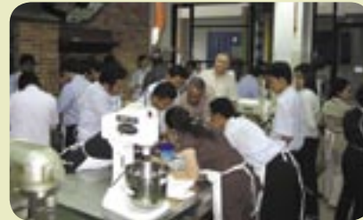
Noodle-making demonstration at Bogasari Baking Center in Jakarta, Indonesia