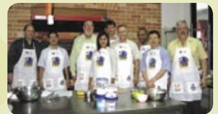
Representatives of the CWB, CIGI and the Canadian Grain Commission with lead bakers of the Bogasari Baking Center in Jakarta, Indonesia