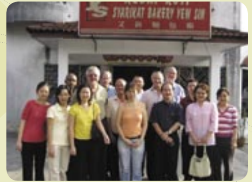
CWB and CIGI representatives pose with the staff of Syarikat Bakery, outside of Kuala Lumpur, Malaysia