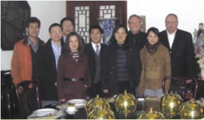
CWB and CIGI staff with representatives of Lijin Food Supplies and Edible Oil Co. in Tianjin, China