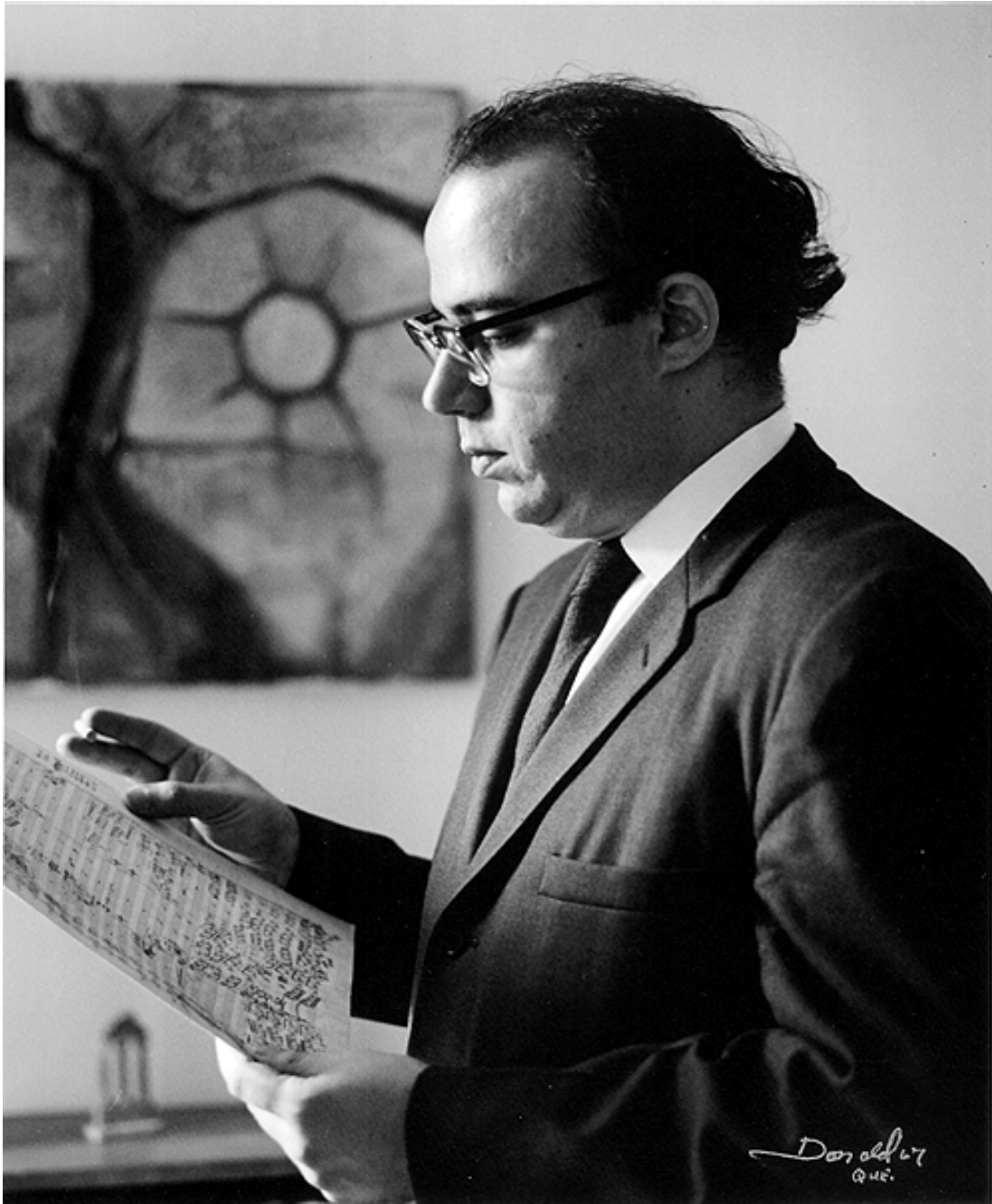
Jacques Héту, 1967. Photograph: Studio Donald. All rights reserved. Reproduction for commercial purposes is forbidden.