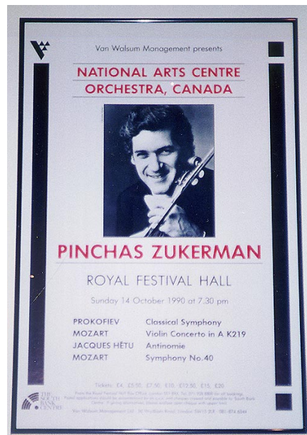
Poster for a concert including Jacques Hétu's Antinomie , 1990. All rights reserved. Reproduction for commercial purposes is forbidden.