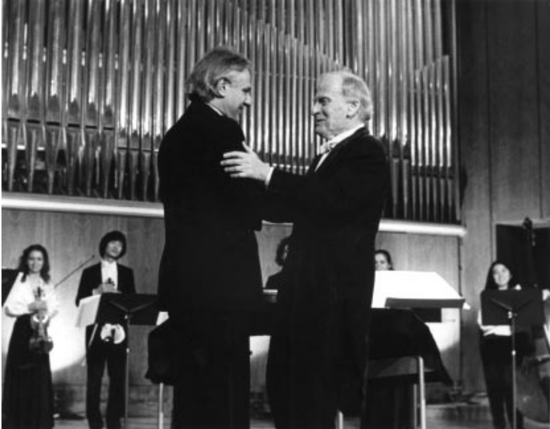
André Prévost and Sir Yehudi Menuhin during the premiere of the Cantate pour cordes, 1987.