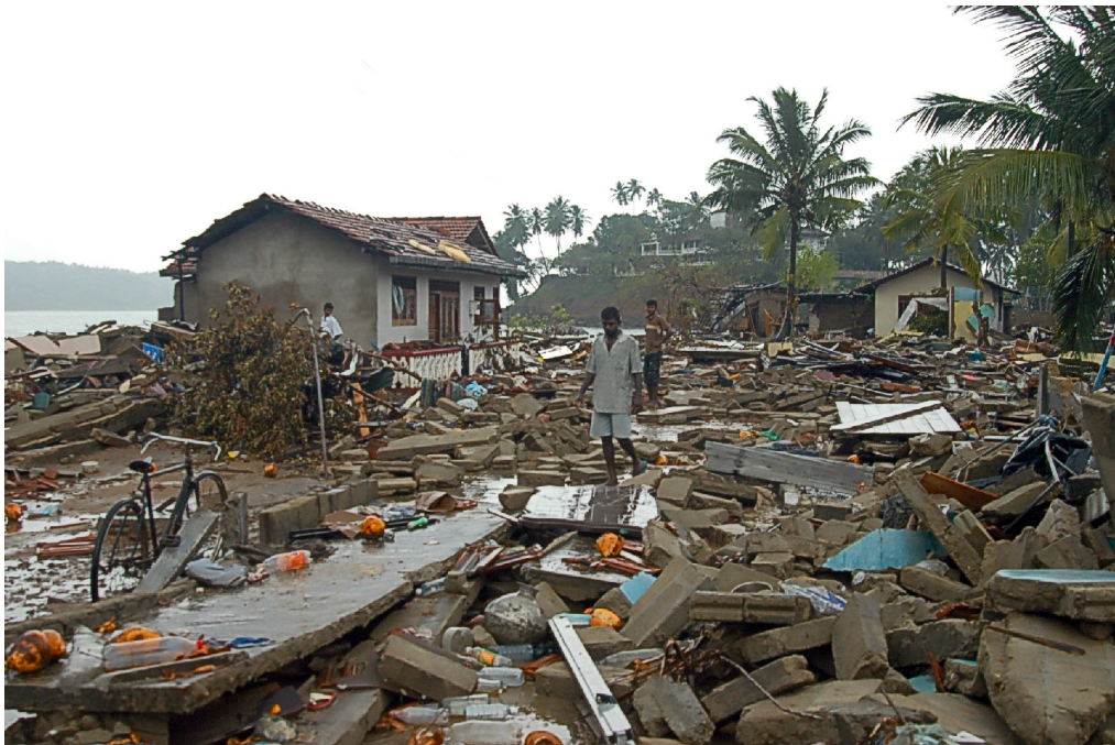
TILL MAYER/IFRC/SRI LANKA/DECEMBER 2004