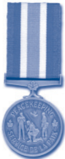
Canadian Peacekeeping Service Medal (obverse)

3) On May 28, 2000, the Right Honourable Adrienne Clarkson, Governor General of Canada and Commander-in-Chief of the Canadian Forces, participated in the funeral for Canada's Unknown Soldier. Here is part of what she said during her eulogy: