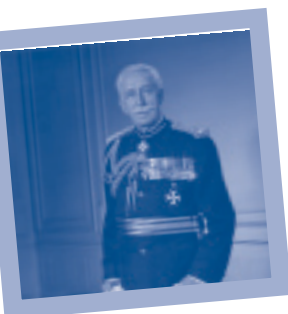
MGen Georges P. Vanier (1959 - 1967)