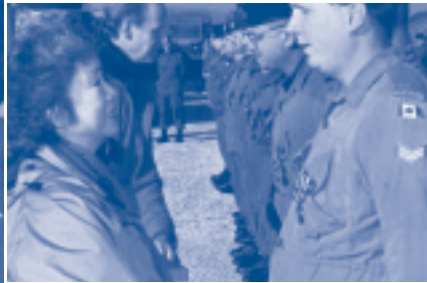
Governor General Adrienne Clarkson presents the NATO Medal for Kosovo during her visit to Donja Koretica, Kosovo (1999)

1 Some Governors General pursued a military career before being appointed. Among other things, they served their country by participating in the armed conflicts involving Canada. By referring to the four photos below, write the name of the Governor General corresponding to the following statements: