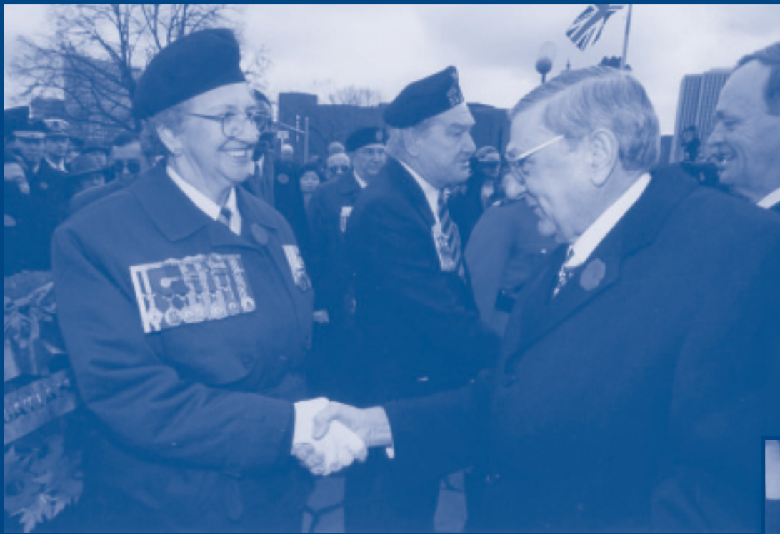
Governor General Roméo LeBlanc with veterans during the Remembrance Day ceremony in Ottawa (1996-11-11)

3) On May 28, 2000, the Right Honourable Adrienne Clarkson, Governor General of Canada and Commander-in-Chief of the Canadian Forces, participated in the funeral for Canada's Unknown Soldier. Here is part of what she said during her eulogy: