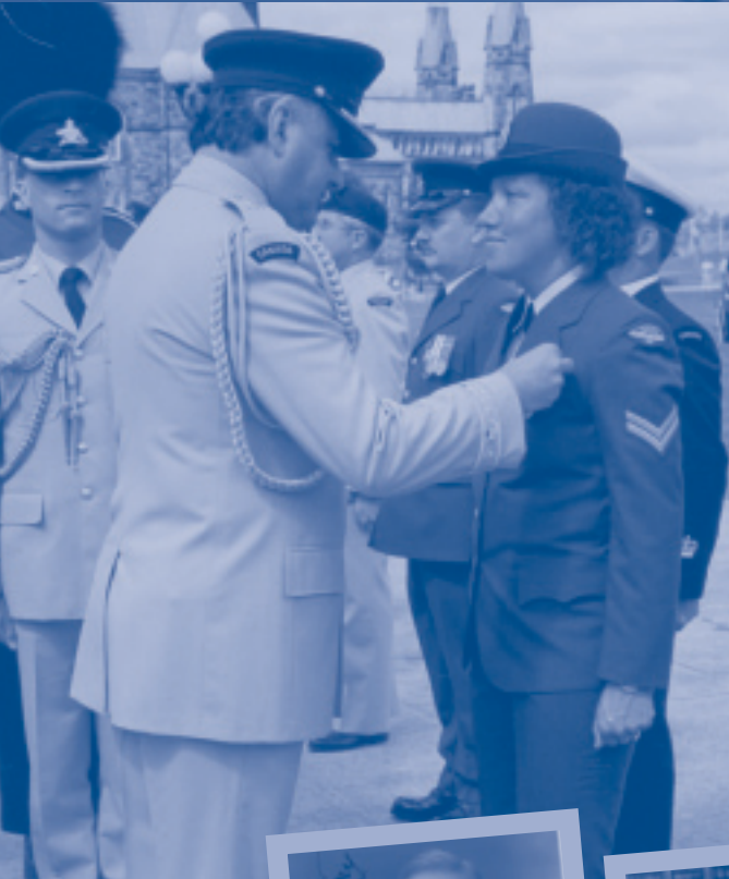
Governor General Ramon J. Hnatyshyn presents the Gulf and Kuwait Medal (1991)

a) His greatest claim to glory was the Canadian victory at Vimy Ridge in April 1917. He was appointed Governor General three years after the end of the First World War.