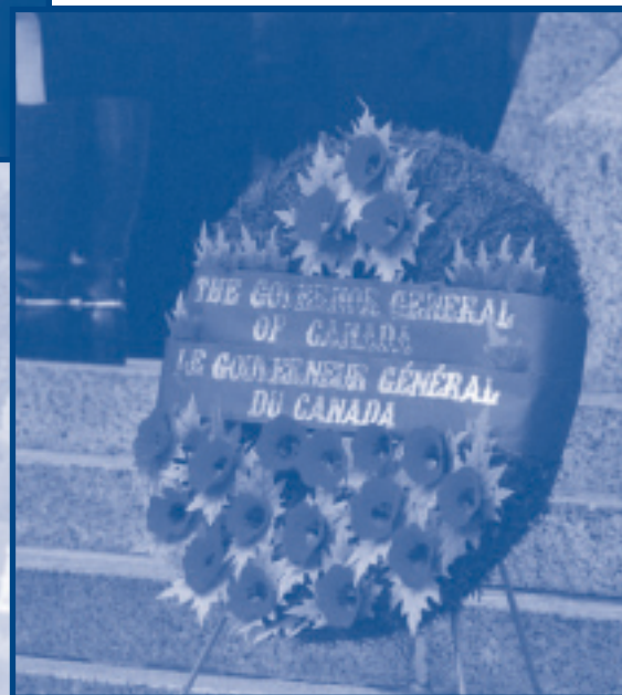
Wreath laid at the foot of the National War Memorial in Ottawa by the Governor General of Canada during the Remembrance Day ceremony