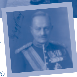
Lord Byng (1921 - 1926)