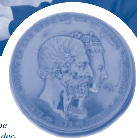
Governor General's Academic Medal (obverse) (Dufferin, 1876)

For more than 130 years, Canada's Governors General have established a tradition of encouraging excellence, creating more than 60 awards and trophies in the arts, social sciences, literature, humanities and sports. Every year, the Governor General presents various orders, decorations and medals to people who have distinguished themselves. This is a way to honour and thank them on behalf of all Canadians for their contribution to society. These distinctions include the Order of Canada, which is the highest mark of esteem the country can grant to its citizens to acknowledge their achievements, merit or exceptional services.