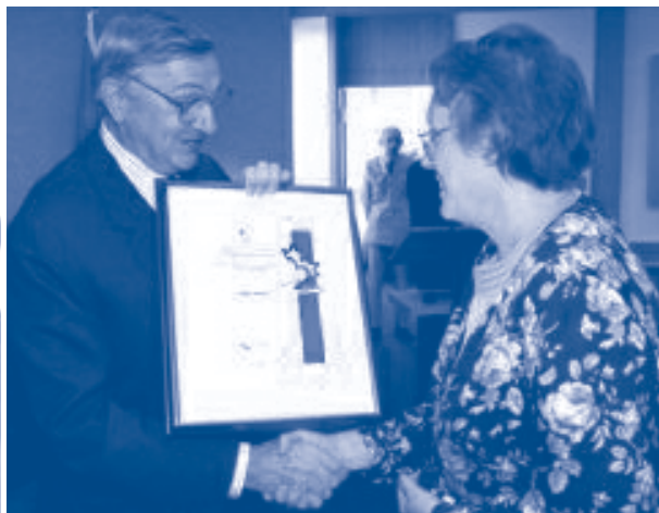
Governor General Roméo LeBlanc presents the Governor General's Caring Canadian Award (1996)