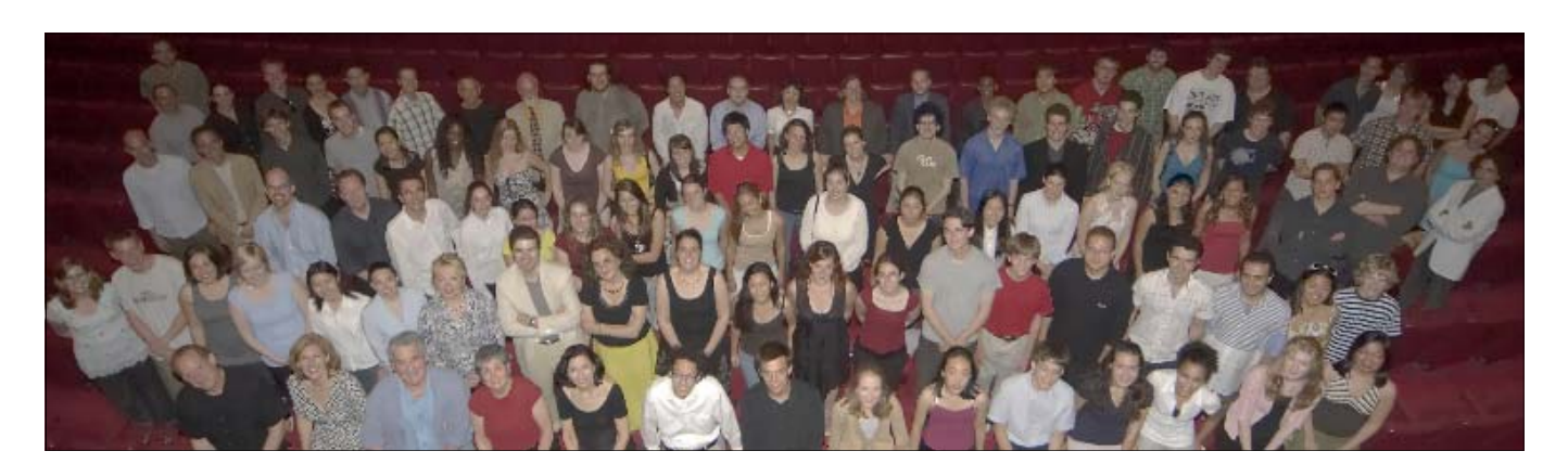
Participants, faculty and staff of the 2007 Summer Music Institute