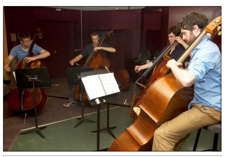
The four double bassists of the Young Artists Programme in rehearsal.

For more information about the Summer Music Institute, please visit the NAC website: <a href="https://www.nac-cna.ca">www.nac-cna.ca</a> (see Education and Outreach, Professional Development).