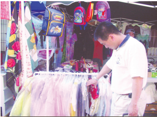
Product Safety Programme regularly visit stores and marketplaces looking for unsafe products

Your health and safety is the priority of more than 400 Health Canada employees in the British Columbia Region. The work of Health Canada impacts each and every British Columbian.