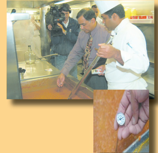
Cruise ship inspection media tour