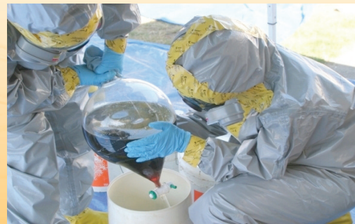
Dismantling an illegal drug laboratory