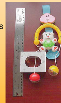
Testing choking hazards in baby toys. The grey apparatus represents the size of a baby's mouth.