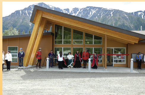
Iskut Nursing Station, officially opened July 2005

Through a variety of funding arrangements, BC First Nations are assuming an increasing role in managing health services in their communities. FNIH provides a range of programs and services for First Nations people, including: drug, dental, vision, patient transportation, addictions treatment, nursing and environmental health.