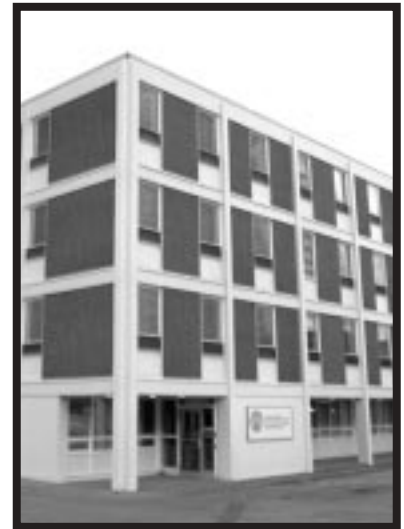
Canadian Centre for Occupational Health and Safety Hamilton ON Canada