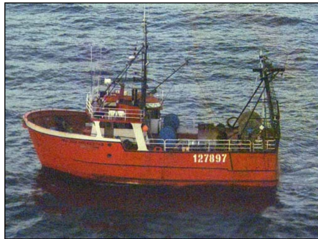
Photo 1. The Melina & Keith II following the work deck enclosure

The Melina & Keith II was a small fishing vessel of closed construction, with an all-steel, welded double-chine hull. The hull below the main deck was subdivided by transverse watertight bulkheads, enclosing a forepeak, water tanks, engine room, fish hold, cofferdam, fuel tanks, and lazarette. Crew accommodation forward and an extended shelter deck aft were located on the main deck, and the wheelhouse was one deck above the accommodation. A single weathertight door led from the accommodation onto the main deck aft, to starboard of which was a galley window. A hauling side door was fitted on the starboard side shell in way of the shelter deck.