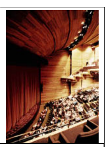
Festival Theatre interior

Shaw Festival, this sleepy little town at the mouth of the Niagara River where it empties into Lake Ontario – the first capital of Ontario, the site of historic Fort George meant to defend British North America against its southern neighbour just across the river, overrun and occupied by American forces for seven months during the War of 1812 – has become a centre of quality theatre applauded throughout North America.