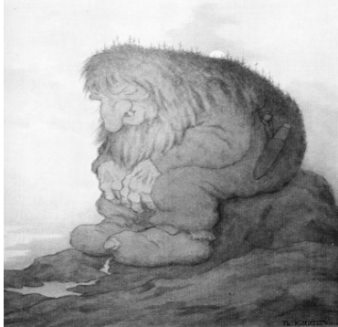
Troll pondering its age (Theodor Kittelsen, 1911).

A troll is a fearsome member of a mythical anthropomorph race from Scandinavia. Their form ranges from fiendish giants to a devious, more human-like folk of the wilderness, living underground in hills, caves or mounds.