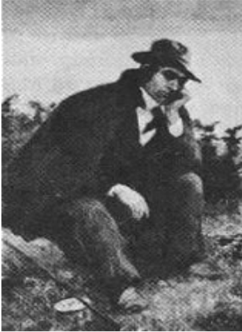
Peter Asbjørnsen (1812-1885)