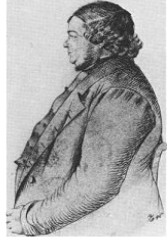
Jørgen Moe (1813-1882)

The story of East o' the Sun and West o' the Moon is traced back to Norwegian writers Peter Asbjørnsen and Jørgen Moe.