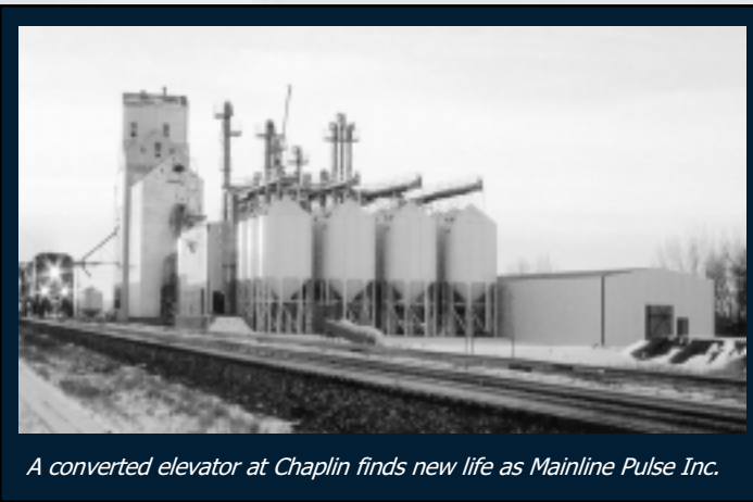
A converted elevator at Chaplin finds new life as Mainline Pulse Inc.

South Central Community Futures Development Corporation