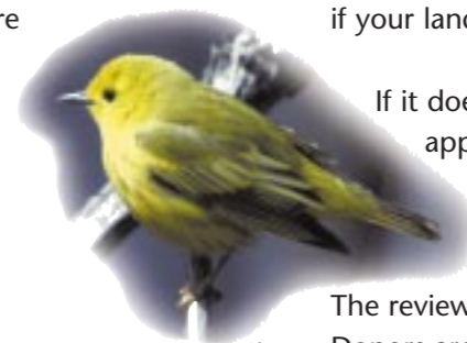
Yellow Warbler

If you wish to proceed, select and contact a recipient to discuss your land, conservation goals, and land securement options. The recipient may help you prepare the documentation required to determine if your land qualifies as ecologically sensitive.