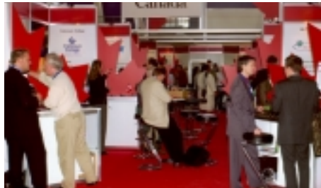
The Canada Pavilion at WEM in Lisbon, Portugal

including e-learning solutions, innovative on-line curriculum, multimedia, learning content management systems and teacher training directed at clients in the educational, corporate and government sectors.