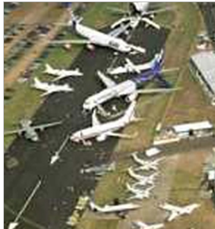
Aerial shot of planes at Farnborough 2002