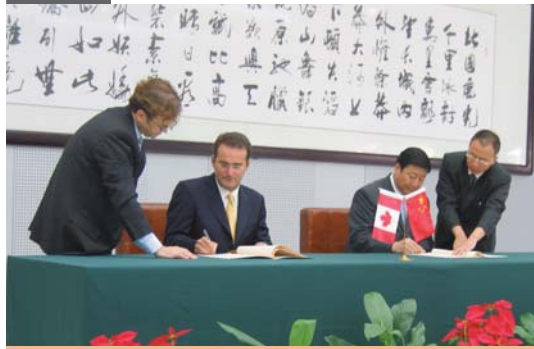
Transport Minister Jean Lapierre and the Chinese Minister of the General Administration of Civil Aviation, Yang Yuanyuan, sign the Memorandum of Understanding on Technical Cooperation in Aviation.

Beijing China > China is the world's fastest growing major economy and has become Canada's second-largest two-way trading partner. A safe, secure and efficient transportation system will be needed to support these growing and important commercial ties. As such, both countries must ensure that their transportation systems are up to the opportunities and challenges of moving an increasing number of goods and people.