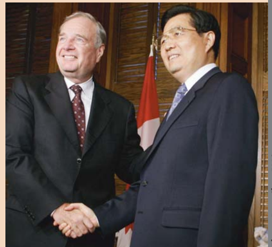
Prime Minister Martin meets with Chinese President Hu Jintao.

The Joint Science and Technology (S&T) Declaration announced during the visit will facilitate cooperative activities between Canadian and Chinese organizations, including the private sector. This is an important step in Canada's discussions with the Chinese on a S&T agreement and these negotiations are expected to be completed by year-end.