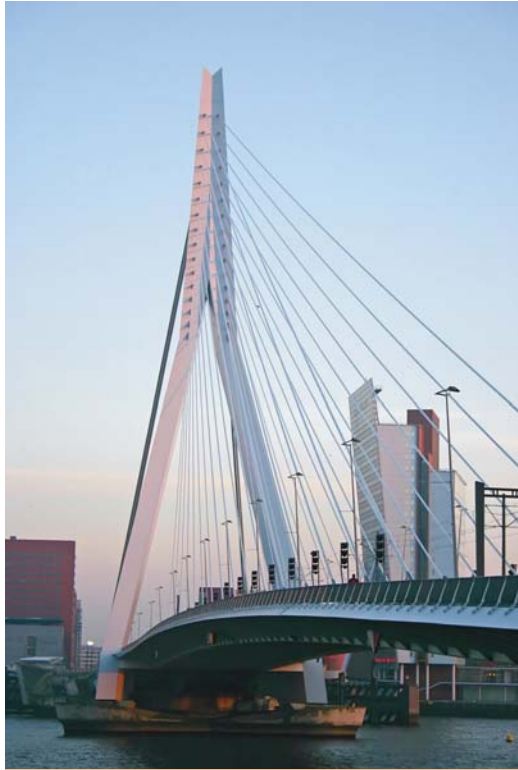
The Erasmus Bridge in Rotterdam.

For those interested more in exporting rather than technology partnering, the Holland International Distribution Council (HIDC) is offering a Webcast that will be of great interest. Together with the Canadian Embassy, HIDC will present on how advanced logistical services operations in the Netherlands permit Canadian companies to establish their supply chains for Europe at much lower cost.