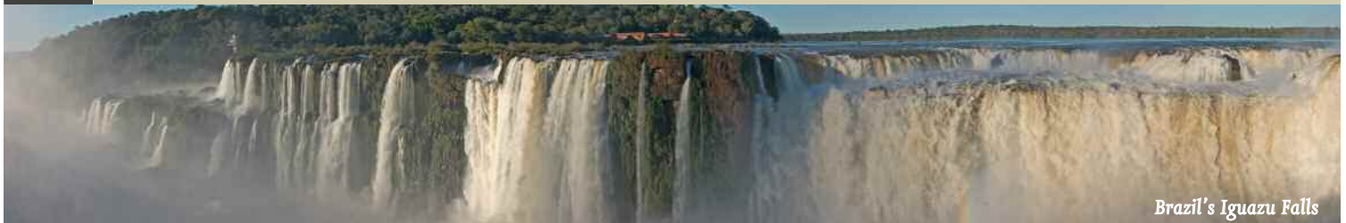
Brazil's Iguazu Falls