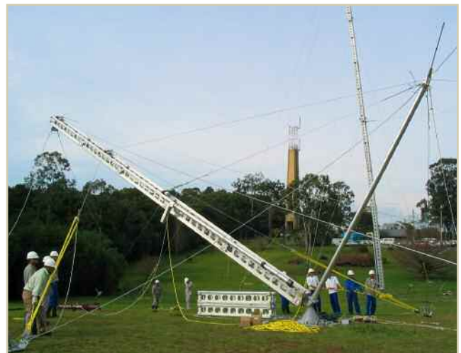
SBB International's emergency electrical towers

SBB International has revolutionized the market for emergency electrical towers. The company has spent 10 years and over $1.5 million developing this fast-mounting tower for the transmission of electricity. In Brazil, the company has sold more than 85 emergency towers valued at more than $6 million. Its towers each provide up to 500 kilovolts of power, are composed of modular aluminum components and can be erected in just three hours.