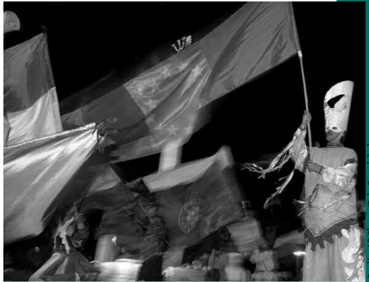
Revellers in Budapest celebrate Hungary's membership in the EU on May 1, 2004.

A 702-kilometre roadway plan, which includes infrastructure projects like the construction of an additional 430 kilometres of expressway by the end of 2006, is currently