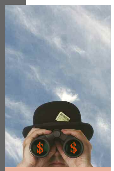
Finding success in business requires a combination of key traits, says one expert.

Countless volumes have been written on what makes a businessperson successful. While each has its own angle, most acknowledge that it's a combination of key traits. According to one expert on the