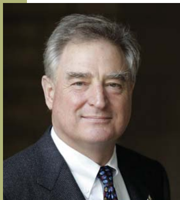
David L. Emerson, Minister of International Trade

The government has appointed a new Minister of International Trade and a new Minister of Foreign Affairs. The government also announced that it will reintegrate the two departments to ensure a coherent approach to foreign affairs and global commerce, while the two ministers will continue to be served by separate divisions within the department.