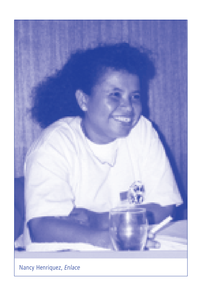
Rights & Democracy 2006

To help develop this project, we ask that you send us a copy of any sheets you add to your kit. We can also send you copies of the sheets that we add over time if you send us your contact information. Please send your comments to: dd-rd@dd-rd.ca.