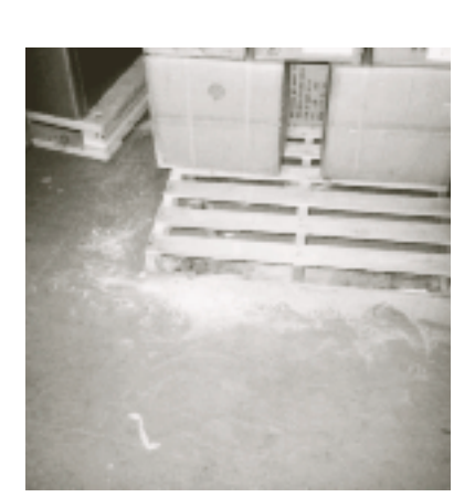
Spilled substance from a foreign shipping container on day of incident