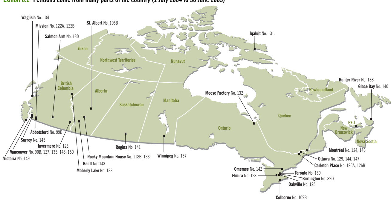
Exhibit 8.2 Petitions come from many parts of the country (1 July 2004 to 30 June 2005)