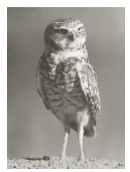
The Burrowing Owl is a species at risk.

a set of decision-making criteria that ministers should consider when recommending to the Governor in Council inclusion of a species on the List of Wildlife Species at Risk. These guidelines are intended to provide greater transparency to Canadians and consistency when advising on whether a species should be listed following a COSEWIC recommendation.