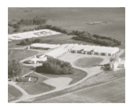
Elstow Research Farm