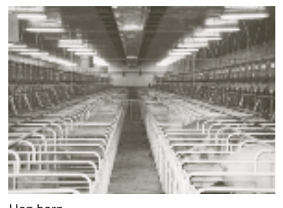
Hog barn