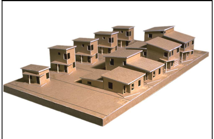
Figure 2: Pro-Home community at various stages of development

Pro-Home's focus on staged expansion distinguishes it from Grow Home, which concentrates on reconfiguring the interior space over time. Sprout, also a Canadian concept, is designed to accommodate expansion like Pro-Home, but it differs in that initial construction involves a small starter home, as opposed to a more basic core section or just the exterior shell.