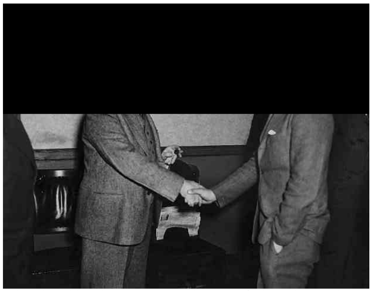
André Mathieu and the Quebec Premier Maurice Duplessis, [ca. 1946].

File containing mainly photographs of André Mathieu with family members and friends. The file also contains two photographs of André Mathieu with Maurice Duplessis.