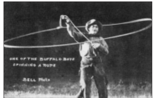
LIKE PEGAHMAGABOW, HENRY NORWEST DEVELOPED AN IMPRESSIVE REPUTATION AS A SNIPER DURING THE WAR. THE FORMER RODEO PERFORMER AND RANCH-HAND WAS CONSIDERED A HERO BY OTHER MEMBERS OF THE 50 TH BATTALION. THEY WERE STUNNED WHEN HE WAS KILLED BY AN ENEMY SNIPER THREE MONTHS BEFORE THE WAR ENDED.