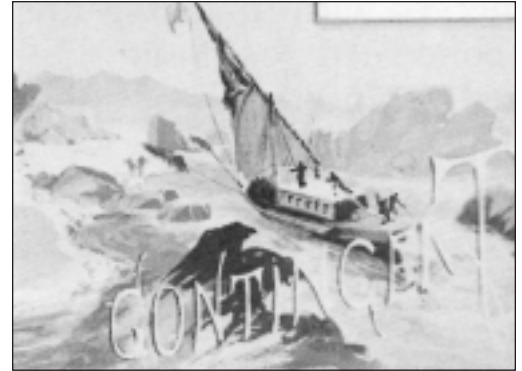
EIGHTY-SIX INDIAN VOLUNTEERS HELPED GUIDE GENERAL WOLSELEY AND HIS TROOPS UP THE NILE RIVER IN 1884 SO THEY COULD RELIEVE BRITISH SOLDIERS DURING THE BATTLE OF KHARTOUM. ALONG WITH SOME 300 OTHER CANADIANS, THESE NATIVE BOATMEN WERE THE NILE VOYAGEURS.

Most Canadians, Natives included, served in the infantry with the Canadian Corps in the Canadian Expeditionary Force (CEF). Many Natives became snipers or reconnaissance scouts, drawing upon traditional hunting and military skills to deadly effect.