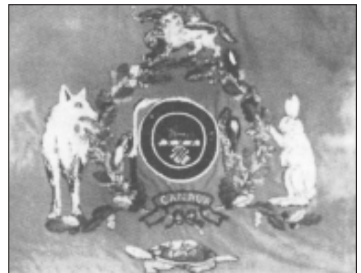
THE SIX NATIONS WOMEN'S PATRIOTIC LEAGUE EMBROIDERED THIS FLAG FOR THE 114TH CANADIAN INFANTRY BATTALION. THE BATTALION HAD PERMISSION TO CARRY IT ALONG WITH THE KING'S COLOURS AND THEIR REGULAR REGIMENTAL COLOURS.