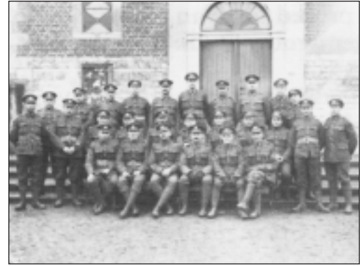
PEGAHMAGABOW SERVED OVERSEAS FOR ALMOST THE ENTIRE WAR AND REMAINED IN EUROPE AN ADDITIONAL FIVE MONTHS AFTER THE ARMISTICE. BACK HOME, HE WOULD JOIN THE MILITIA. HERE THE CORPORAL (FAR LEFT) POSES WITH OTHER NON-COMMISSIONED OFFICERS OF THE 1 ST BATTALION TWO MONTHS AFTER WAR'S END.

One of the most famous Canadian snipers in the First World War was a Métis marksman who went by the name of Henry Louis Norwest. Norwest was born in Fort Saskatchewan, Alberta, of French-Cree ancestry. In his nearly three years of service with the 50 th Canadian Infantry Battalion, the lance-corporal achieved a sniping record of 115 fatal shots. 33 The former ranch-hand and rodeo performer also merited the Military Medal and bar, making him one of roughly 830 members of the CEF to be awarded this double honour. 34