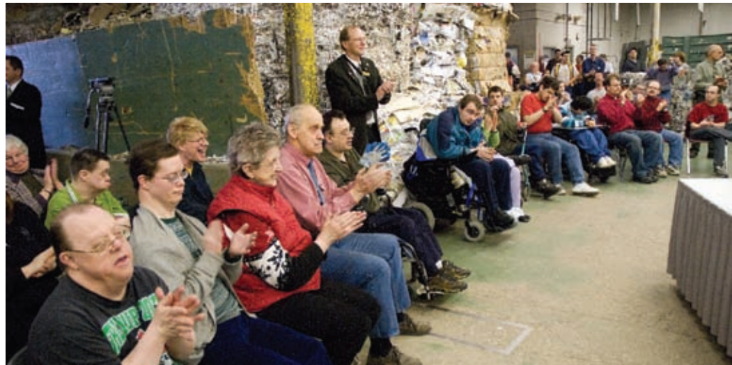
Staff and participants of Cosmo's special program for people with disabilities applaud news of the expansion of the recycling plant.

"Cardboard is a worldwide commodity," Gerrard says. "With the expansion, we hope to recycle more cardboard and increase revenue." ■