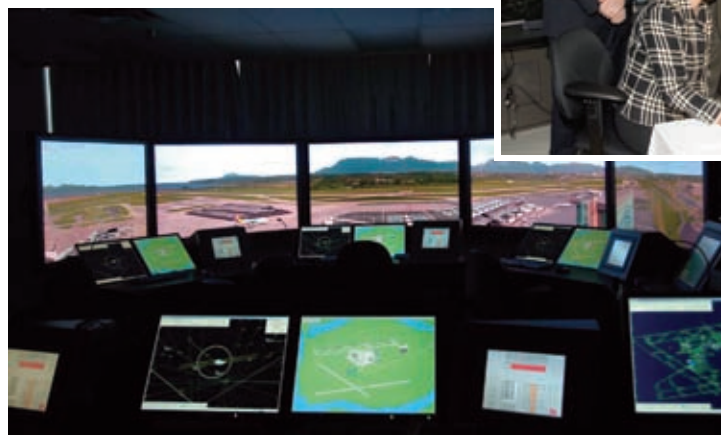
Raytheon's FIRSTplus tower simulator.

The ATM Lab will be located in BCIT's new 300,000 square foot Aerospace Technology Campus at Vancouver's International Airport. It will be the showcase laboratory as part of the campus's new Security Transportation and Research Initiative. For more information about the lab, visit www.bcit.ca/transportation/aerospace/ . ■