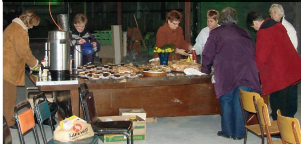
Pilot Mound community members enjoying a break during construction of their new Millennium Recreation Complex, funded under MRIF.

OVER ITS LIFESPAN, MRIF WILL SEE OVER $686 MILLION INVESTED IN INFRASTRUCTURE ACROSS THE WEST.