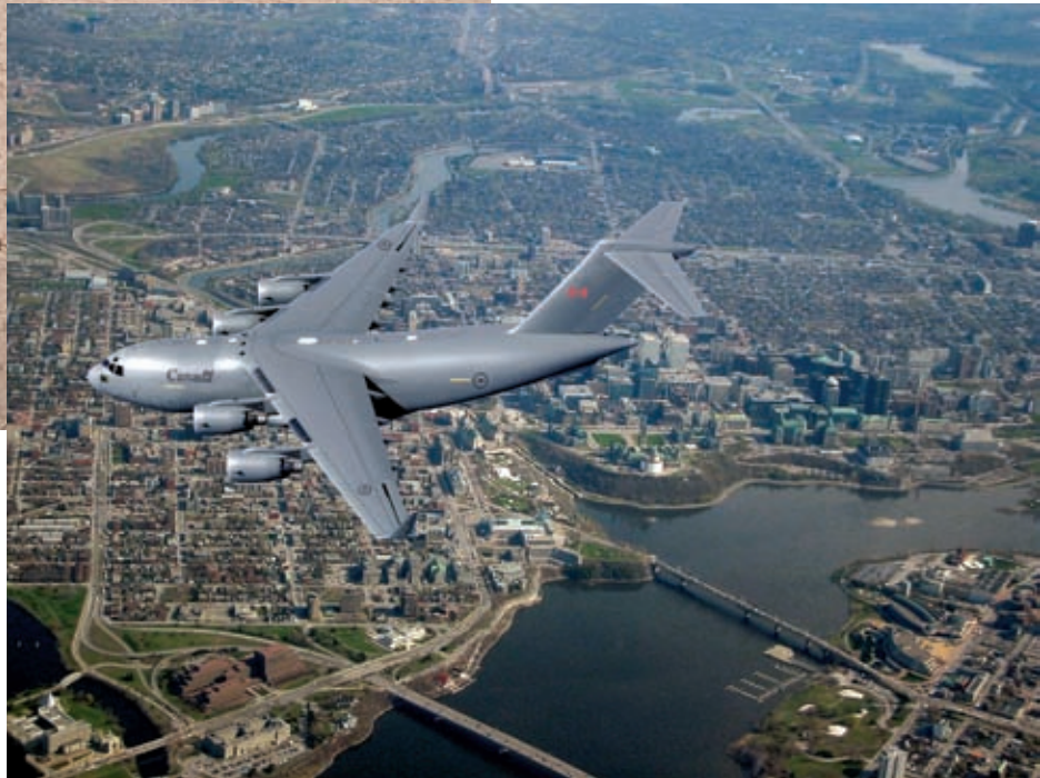
Canada’s acquisition of four Boeing C-17 Globemaster III planes, at a contract value of $3.4 billion, means substantial benefits to Canadian industry.