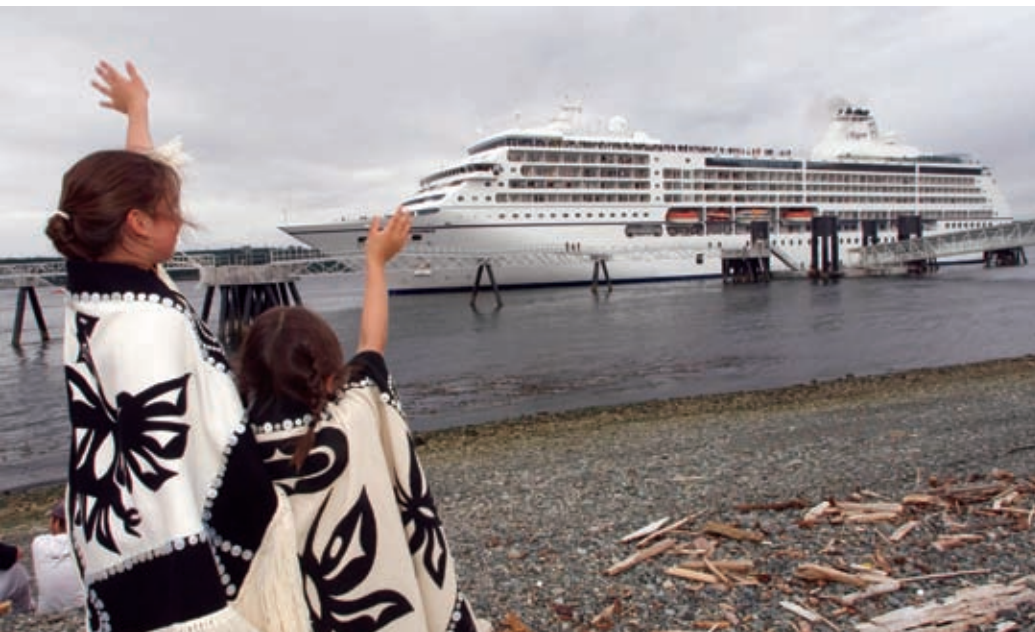
Campbell River kids greet ship at the opening of the first-ever Aboriginal-owned cruise ship terminal