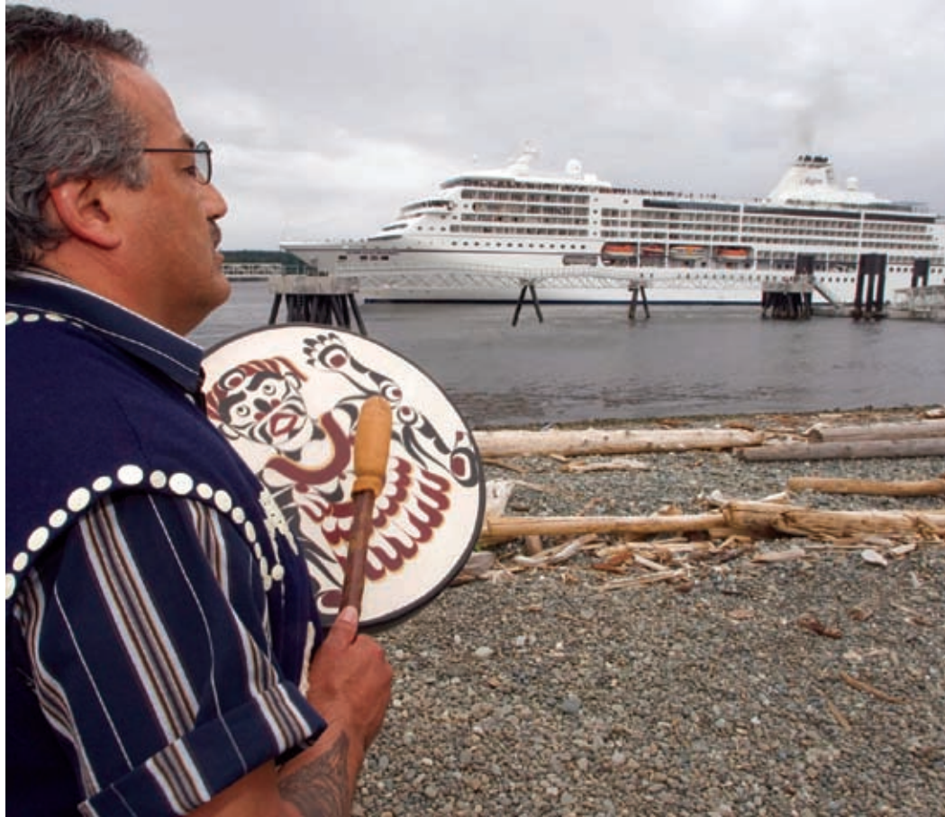
Aboriginal drummers and dancers at the Wai Kum terminal offer visitors a uniquely Aboriginal experience.

A visit to the Wei Wai Kum terminal promises a distinctly Aboriginal experience. Upon arrival, visitors see a traditional village complete with totem poles and a Big House, providing a window into Laichwiltach history and culture.