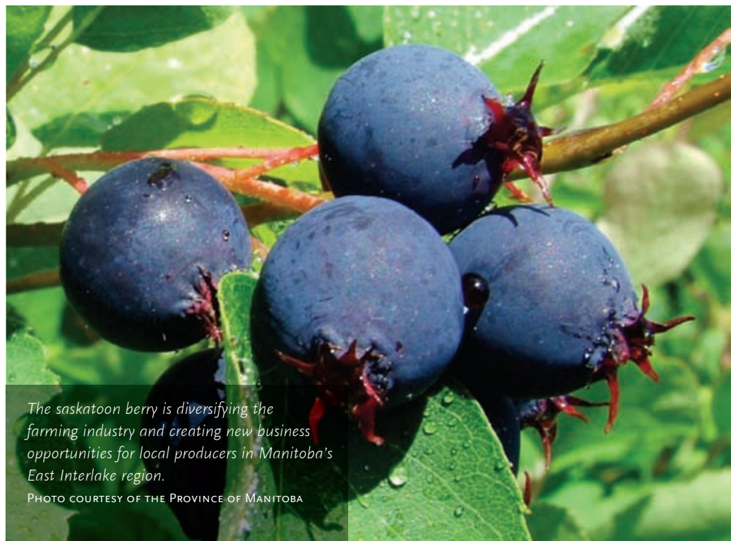
The saskatoon berry is diversifying the farming industry and creating new business opportunities for local producers in Manitoba's East Interlake region.

To date, SADICC has leveraged over $275,000 in funding for this initiative and is now busy at work exploring new agricultural opportunities for the East Interlake region. ■