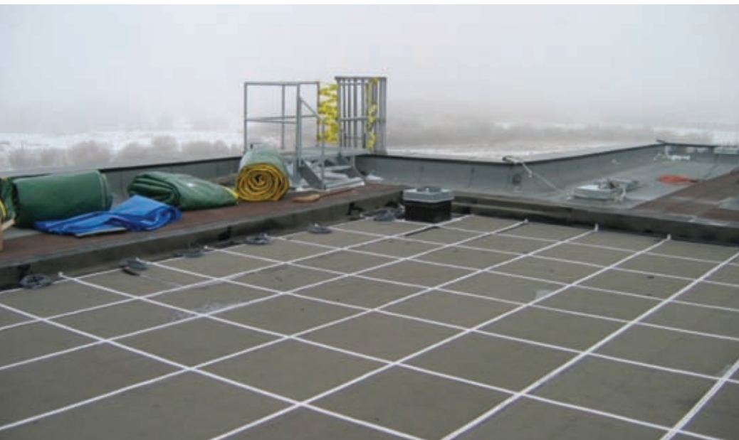
Roof installation of SMT's moisture detection and monitoring system.

Smartpark is an initiative supported by WD. For information on the eureka project, visit www.eurekaproject.ca . ■