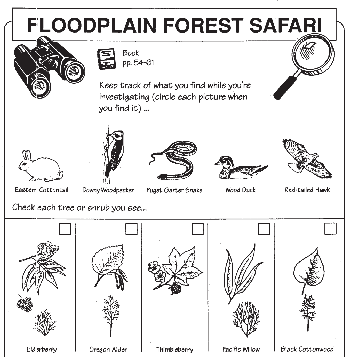
...AND draw pictures of, or describe, other organisms you find.