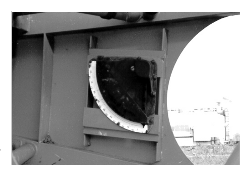
An inclinometer was affixed to the crane's arm.

The crane operator was instructed by his supervisor to prepare the crane and barge for towing down the south arm of the Fraser River. The preparations included, inter alia , lifting the spuds, stowing them on top of the deck-house and securing the crane and boom. The supervisor gave no specific instructions as to