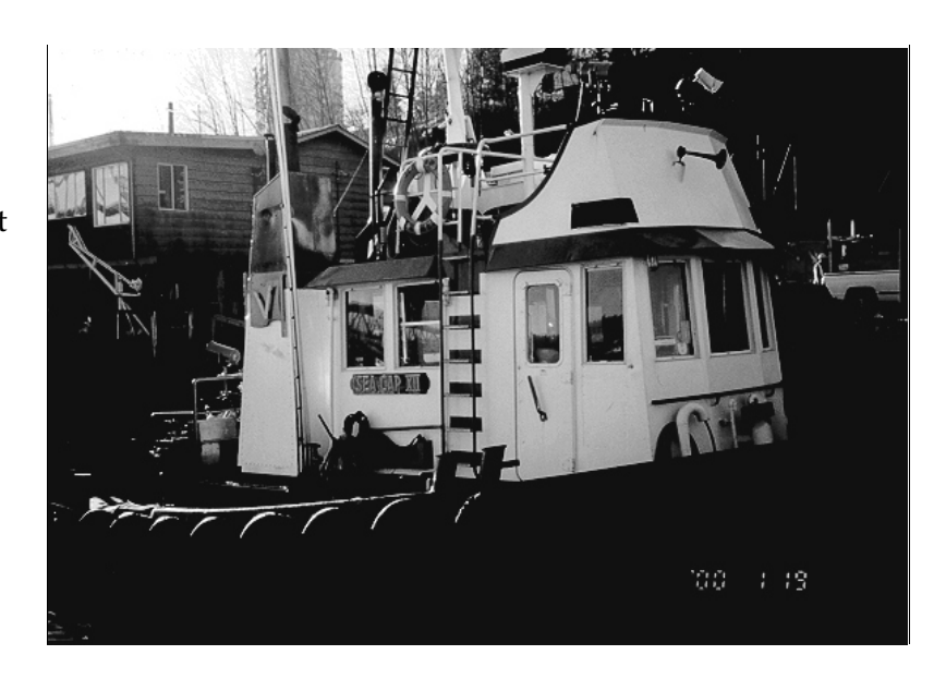
"SEA CAP XII"

The "SEA CAP XII" is a small steel tug used mostly in the Fraser River, and occasionally for some light duties in the waters of the Strait of Georgia. It has two propellers in Kort Nozzles and four rudders connected by a bar. At the forward end of a midship deck-house is a control panel with navigation, steering and engine controls; at the after end is a galley. The deck-house, fitted with windows on all four sides, has an almost 360-degree view from the inside. The door leading to the stern of the tug is partially glassed. There are two