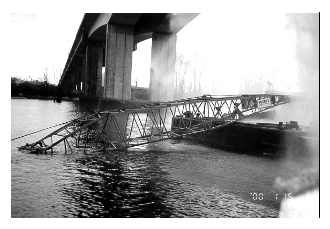
The crane moved off the barge's deck and sank under the bridge with its boom, bent during the striking, extending above the surface.

The post-occurrence report by the British Columbia Ministry of Transportation and Highways contains a detailed damage assessment. The bridge remained closed to all vehicle traffic for about 48 hours.