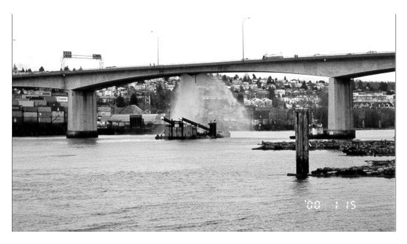
The Knight Street Bridge South seen from the west immediately after the occurrence. The barge "T.L. SHARPE" with spuds in the cradle and pointing forward is "anchored" under the bridge by the sunken crane astern. Water is escaping from the broken pipe.

bridge the crew heard a crashing sound. When they looked back they saw the boom swaying and buckling. The top of the boom was scratching against the underside of the concrete span. Bits of concrete were falling onto the barge, followed by water from an overhead pipe. The skipper reduced propulsion to slacken the pull; however, the barge still had some momentum and the crane, with the top of the boom wedged under the bridge, shifted off the deck and sank astern of the barge.