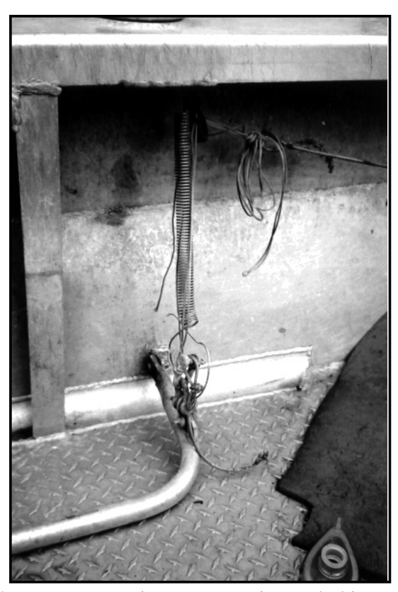
Photograph 4. Disconnected remote stop device (hold-to-run control).