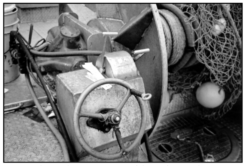
Photograph 2. Manoeuvring stand showing by-pass valve.