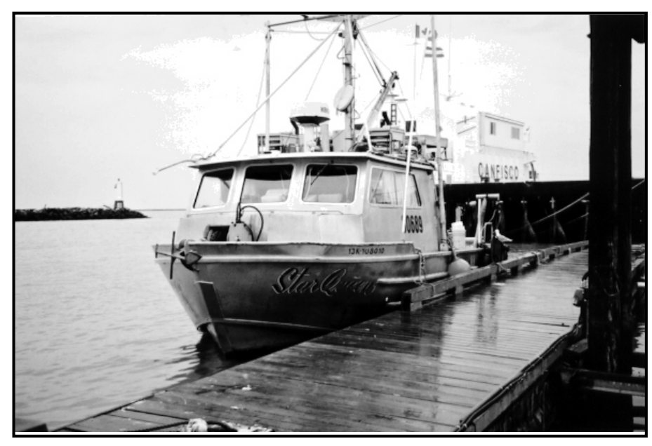
Photograph 1. "STAR QUEEN" alongside.