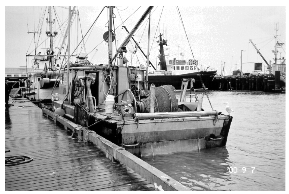
Photograph 3. View of the after deck.