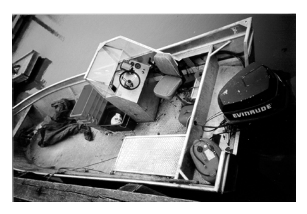
Overview showing fish crates