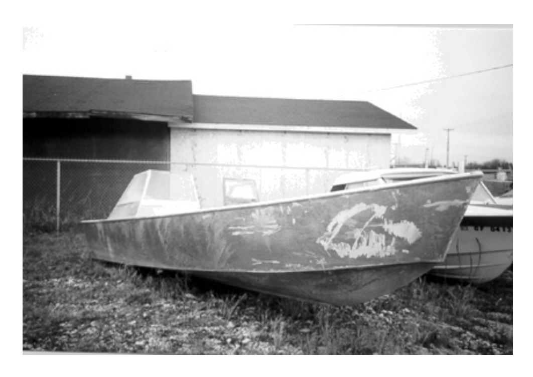
A Lake Winnipeg yawl similar to the occurrence vessel