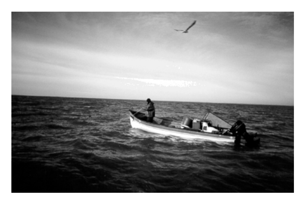
A fisher gill netting.