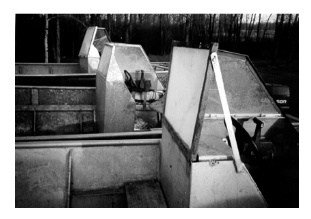
Typical split-console engine control station