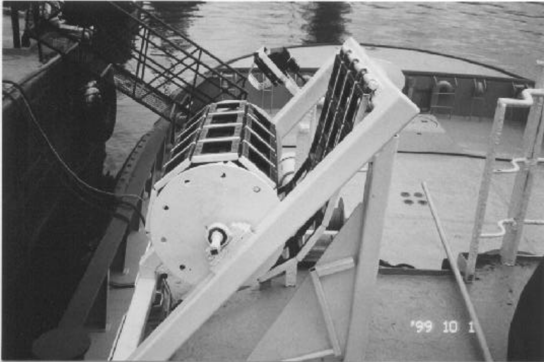
Photograph 4. Jason's cradle permanently installed on a tug used as pilot boat at Québec.