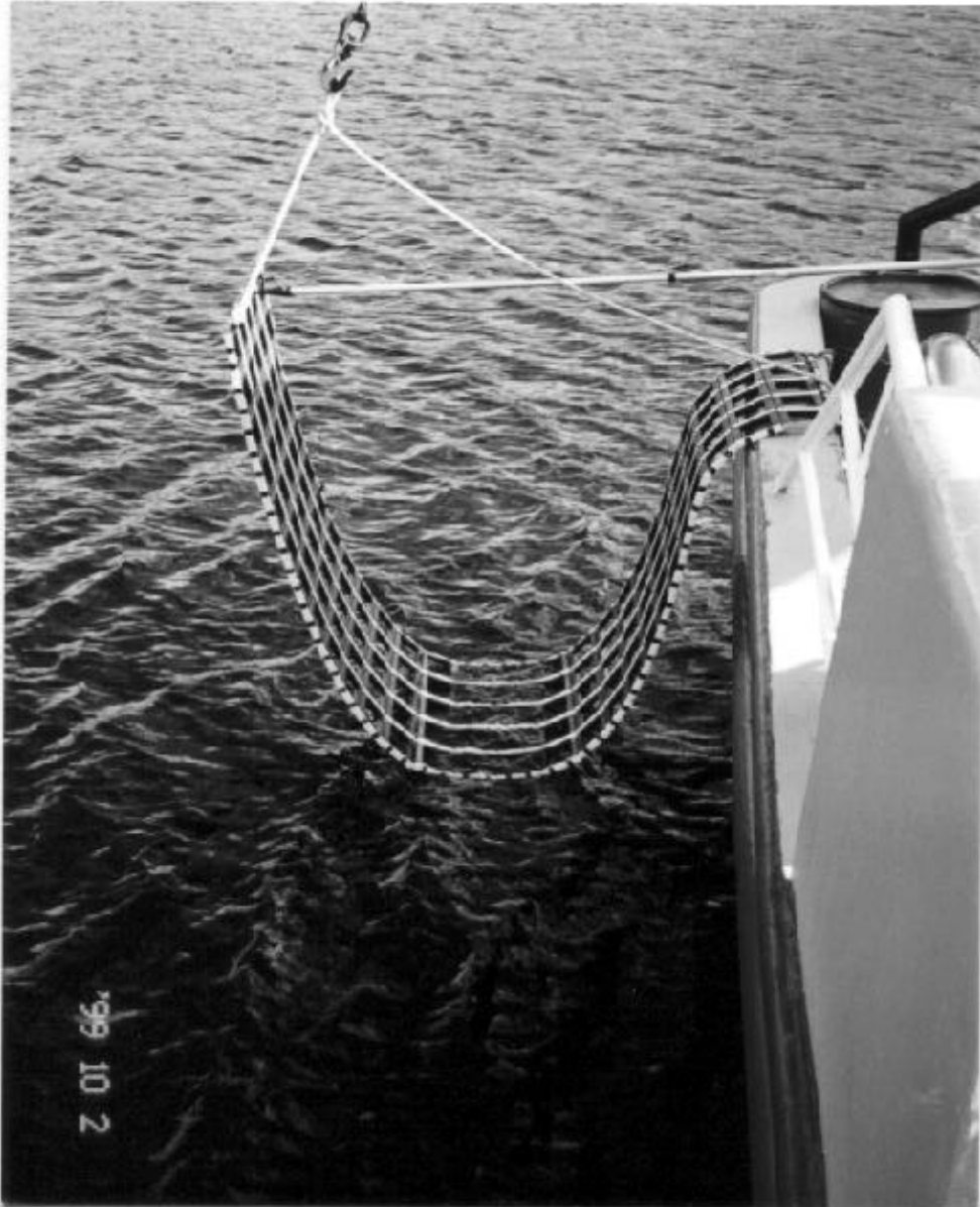
Photograph 3. Jason's cradle deployed on the CCGS "ÎLE ROUGE" at Tadoussac, Quebec