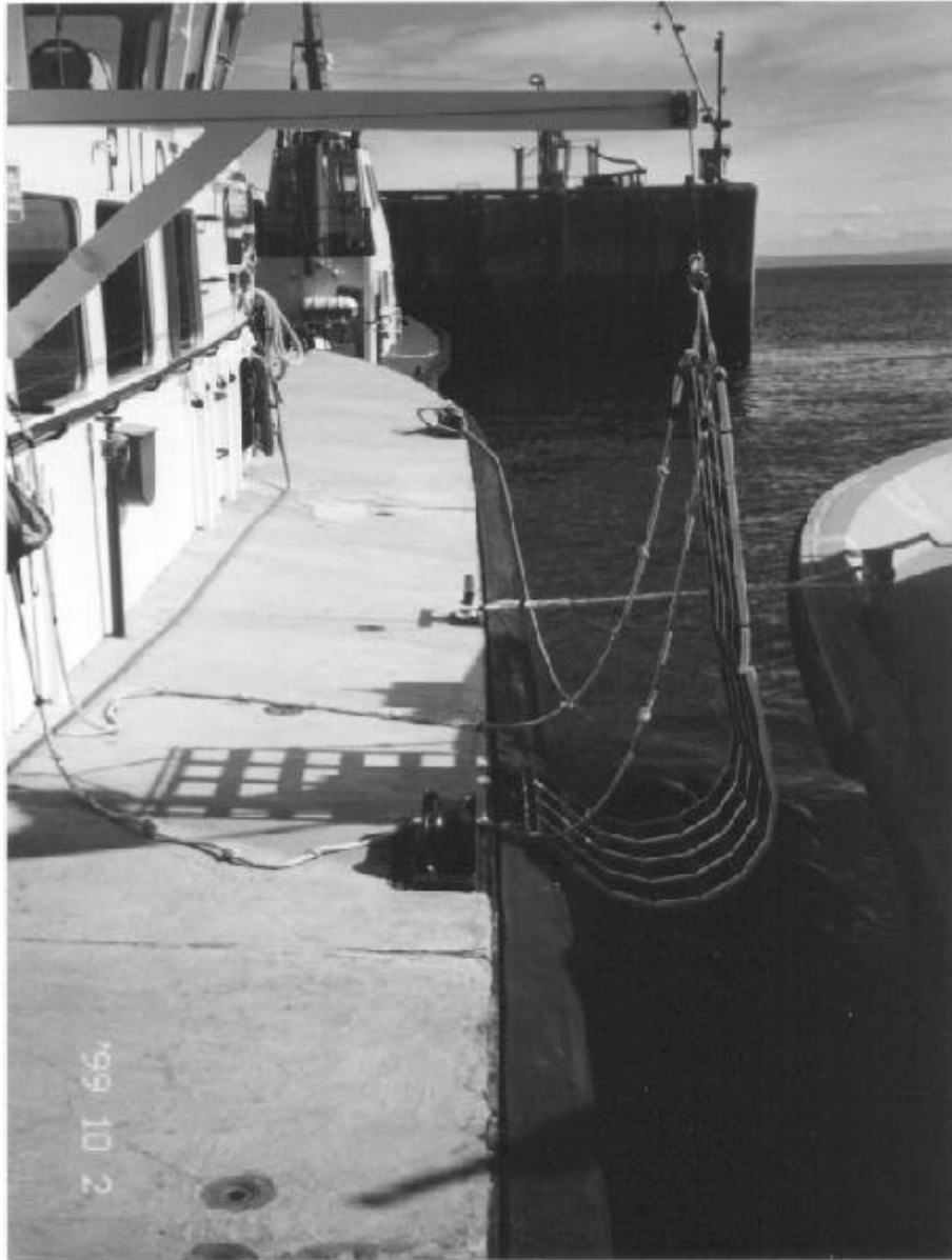
Photograph 2. Jason's cradle temporarily rigged on the "CHARLEVOIX".