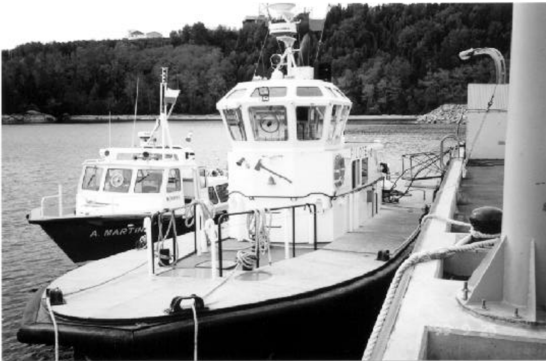
Photograph 1. Pilot boat “CHARLEVOIX” moored at the Les Escoumins pilot station.