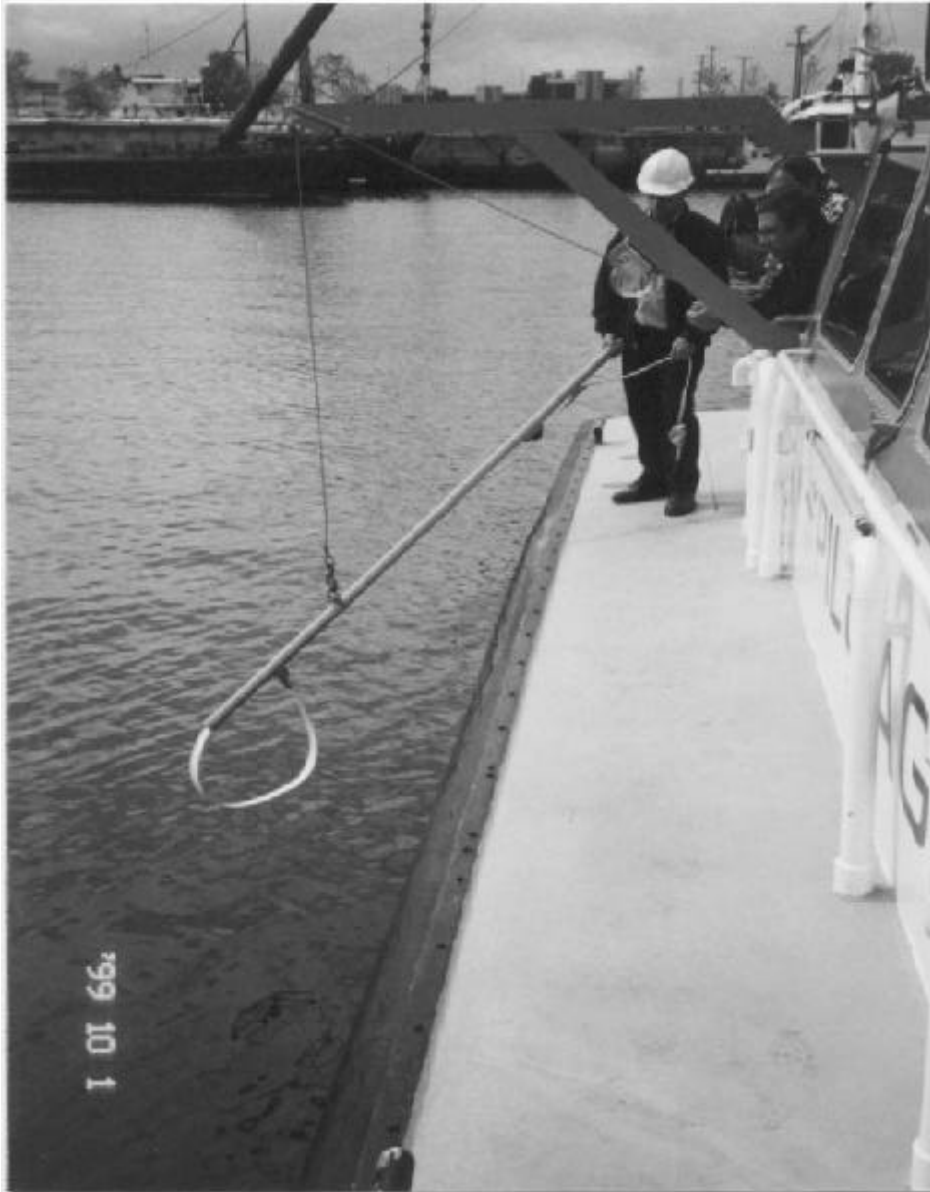
Photograph 5. Mate Saver for recovering unconscious man overboard on one of the two new pilot boats at Québec. The pilot boats are also equipped with Jason's cradles.