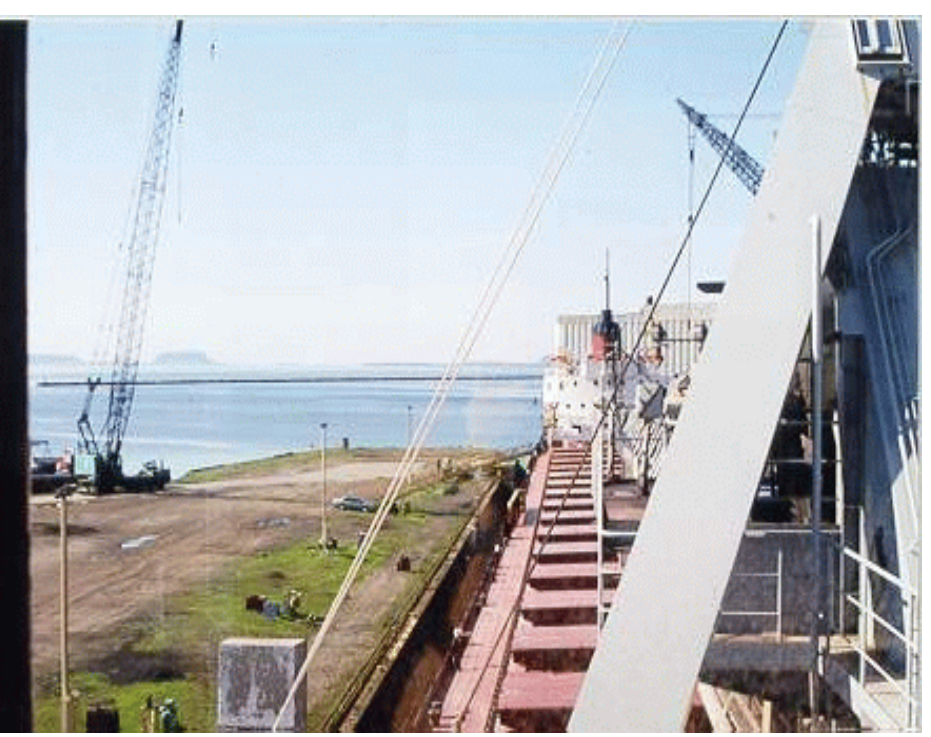
outbound vessels. A Photo 2. Starboard side of bridge looking aft pre-departure plan for

Outside the harbour, there was a current of one-half to one knot running from south to north. The operating company requires their masters to have a predeparture passage plan prepared for harbour inbound and outbound vessels. A