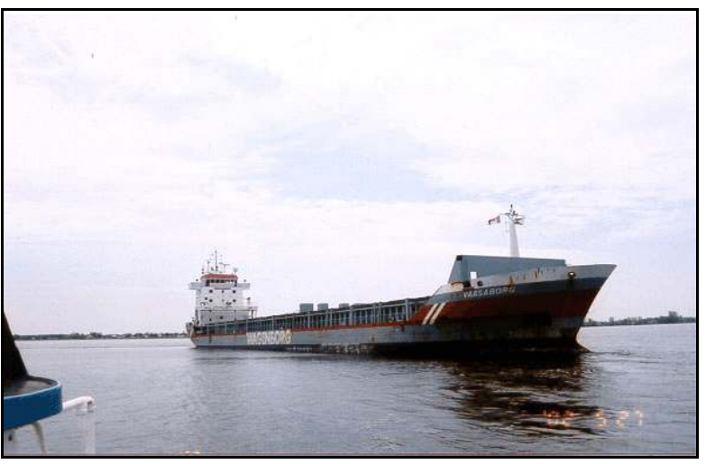
Photo 1. Vaasaborg aground. The vessel was refloated after lightening the cargo by some 1800 metric tons.

The wheelhouse is located on top of the narrow accommodation