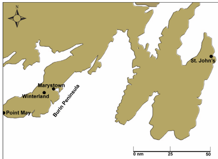
Figure 1. Burin Peninsula area

The Canadian Coast Guard (CCG) helicopter, operated by Transport Canada (TC) Aircraft Services Directorate (ASD) as call sign CG352, was based in St. John's, Newfoundland and Labrador. On the day of the accident, the first task was to move personnel and supplies to the Green Island lighthouse, which is located 7 nautical miles (nm) off the southern tip of the Burin Peninsula. CG352 was then to proceed to Marystown,