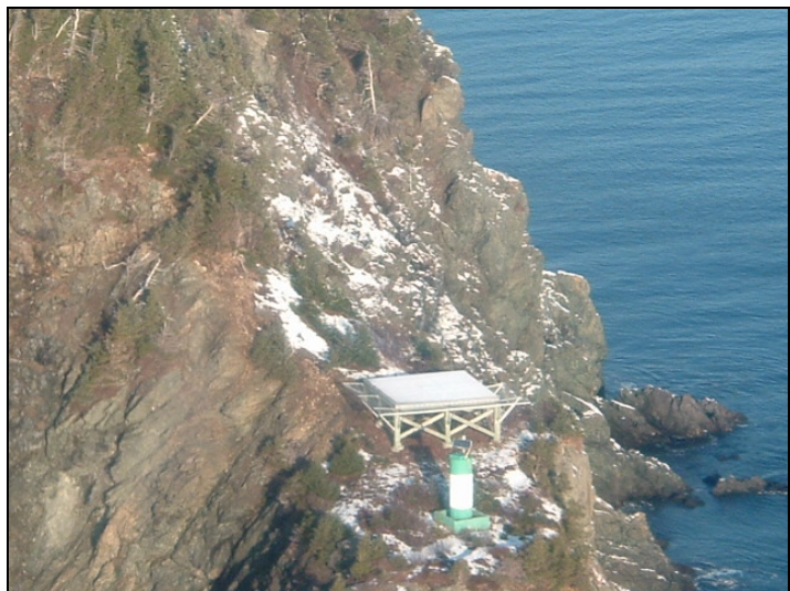
Photo 1. Go By Point looking north

After loading the helicopter, the pilot and his passenger flew to a helicopter landing pad at Go By Point, at the entrance to Mortier Bay. This was a very short flight because Go By Point is only 3 nm southeast of Marystown (see Appendix A). The Go By Point landing pad is situated on steep and rocky terrain next to a marine navigation light (see Photo 1). At 1517, the pilot reported to the MCTS that he had landed at Go By Point and anticipated one hour of work. He then shut down the helicopter, and he and the passenger disembarked.