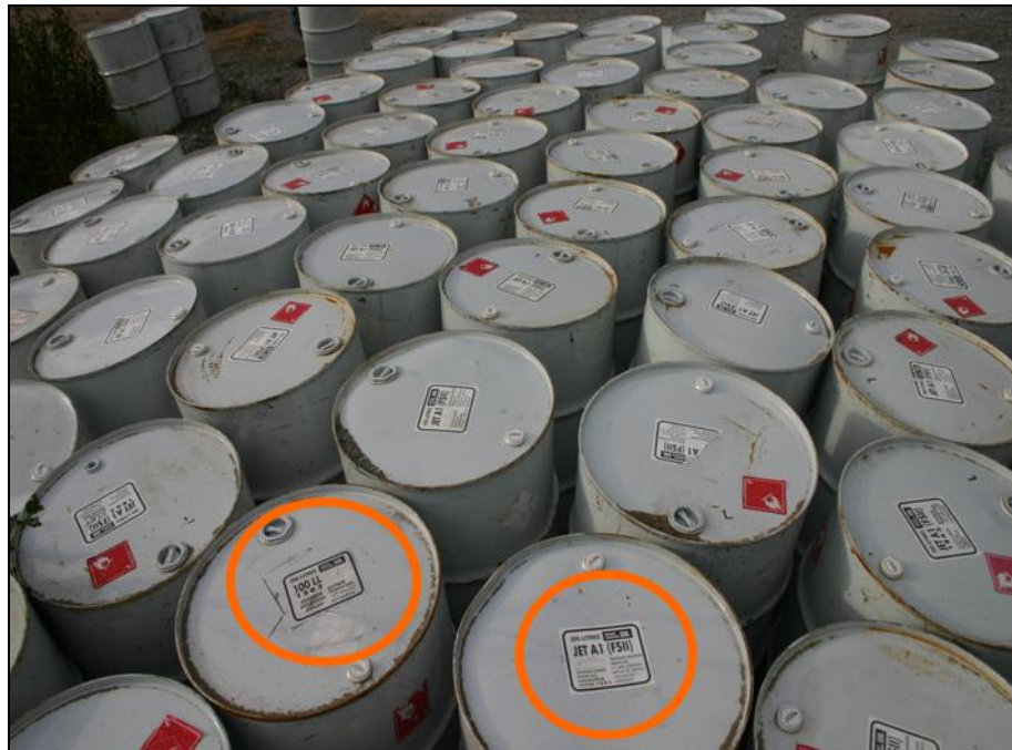
Photo 3. View of fuel barrels and identifying stickers

This fire operation required four helicopters, all of which used Jet A1 fuel. Since no other aircraft requiring AVGAS had been contracted, the helicopter operator was not concerned that there could be barrels of AVGAS mixed with the delivery.