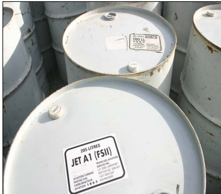
Photo 4. Fuel barrel identifying stickers

AVGAS is considered a Class 1 petroleum product and under existing provincial regulations, a Class 1 product over 45 litres does not require any kind of colour coding of the container. However, a container under 45 litres, containing a Class 1 product, must be predominately red in colour. Therefore, by provincial law, the 205-litre barrels of AVGAS do not have to differ in colour from a Class 2 (Jet