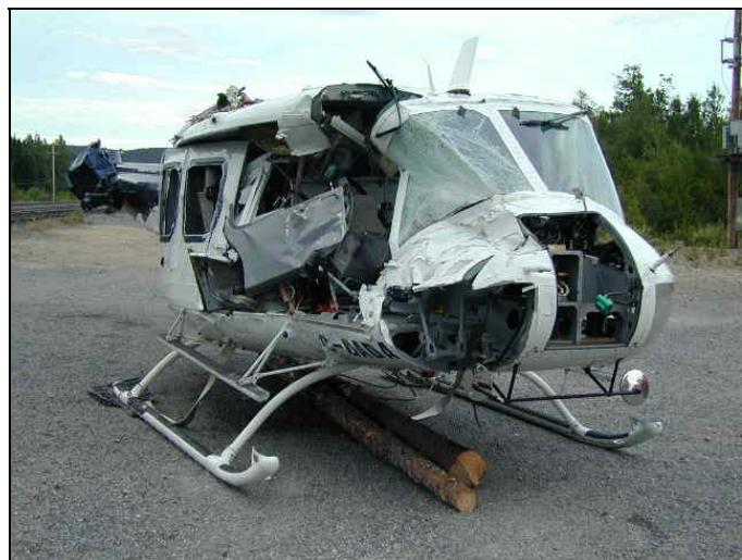
Photo 1. Damage to Bell 205 A-1, C-GADA

The helicopter came to rest inverted approximately 1000 feet from shore in about 25 feet of water and silt, which totally obscured the water during salvage operations. The initial attempt to retrieve the helicopter by the cargo hook resulted in the lift beam being torn off and lost. The water bucket, the tail rotor, and all parts that had been separated from the airframe could not be located due to the lack of visibility under water. Once the helicopter was recovered, examination of the airframe confirmed a nose-down impact on the right side (Photo 1).