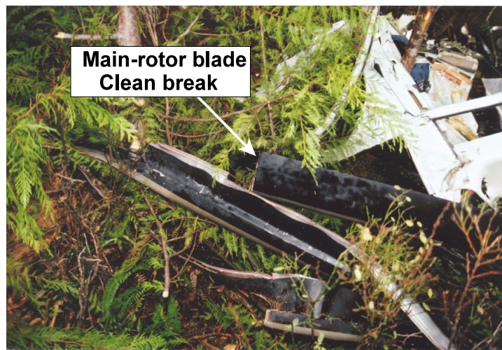
Figure 1 - Main rotor blade break

Marks on the aft fuselage showed that the main rotor blades had severed the tail section. All of the lead and lag blade dampers were torn apart. The helicopter is fitted with five main-rotor blades that are identified by colour. The red blade was notable in that it showed a clean break about one-third of the distance from its root (see Figure 1). The break was perpendicular to the leading edge of the blade, and the break in the spar was recessed from the skin. The outboard two-thirds of this blade was not found. The white blade was missing completely, including its main-rotor blade grip. The yellow blade was missing its end one-third and showed clear damage from hitting the tail section. The green blade was torn into two pieces after it had stopped turning. The blue blade was the only blade in one piece. Apart from the damage caused