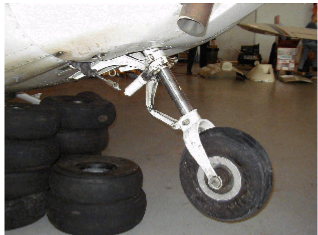
Figure 1 The damaged Cessna 172 nose gear assembly

Records indicate that the Cessna 172 was certified, equipped, and maintained in accordance with existing regulations and approved procedures. It sustained substantial damage to the nose gear assembly and surrounding structure. The lower landing gear support/attach bracket was sheered off but remained attached to the landing gear leg. The upper landing gear support/attach bracket remained attached by one bolt. The steering arms were torn off at their attach points, the rudder torque tubes were bent, the lower firewall was wrinkled, the lower engine cowl mount was damaged and wrinkled, and the upper forward cockpit floor skin was slightly deformed.