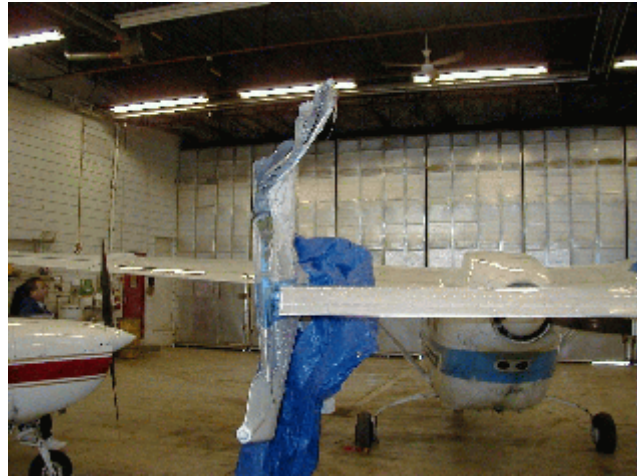
Figure 2 The Cessna 337's left vertical tail and rudder

Records indicate that the Cessna 337 was also certified, equipped, and maintained in accordance with existing regulations and approved procedures. It sustained substantial damage to the left vertical tail and rudder. The aft portion of the upper half of the vertical tail was torn off along with the upper half of the rudder. The forward portion of the upper half of the vertical tail was bent inwards and displayed an imprint of the Cessna 172 nosewheel tire. The lower portion of the vertical tail and rudder were slightly deformed.