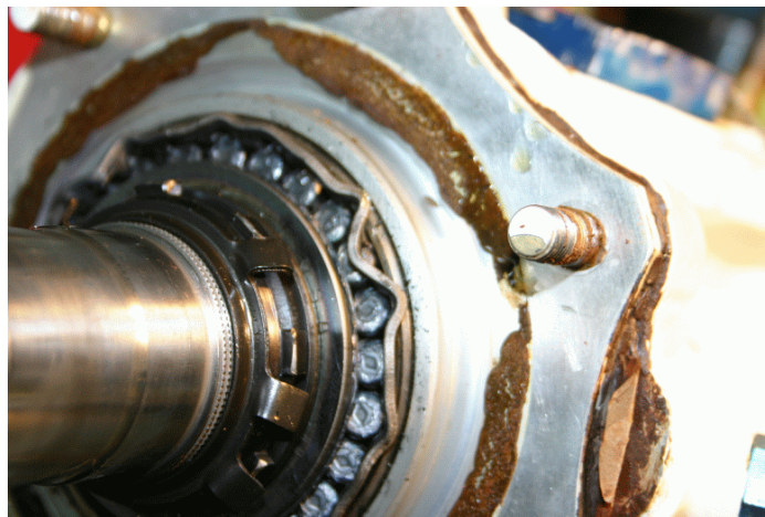
Photo 1. Distorted bearing cage

When the main transmission gearbox was being reassembled, the input quill bearing housing was assembled incorrectly. It was rotated clockwise 90 degrees in relation to the main transmission gearbox oil inlet and outlet ports. This condition contributed to the blockage of the oil passage feeding the bearings and caused the catastrophic failure of the input quill bearings. This type of failure is known as skewing, where the individual bearings jam together when the bearing cage fails (see Photo 1).