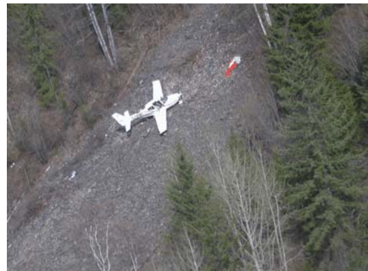
Photo 1. Accident site

At approximately 2111, the aircraft/parachute landed on a steep mountainside on the southern slope of Mount O'Leary, British Columbia at the 2300-foot level. The aircraft sustained substantial damage, but there were no injuries. A search and rescue operation was initiated. The four occupants were found and rescued early the following morning and returned to Kelowna by military helicopter.