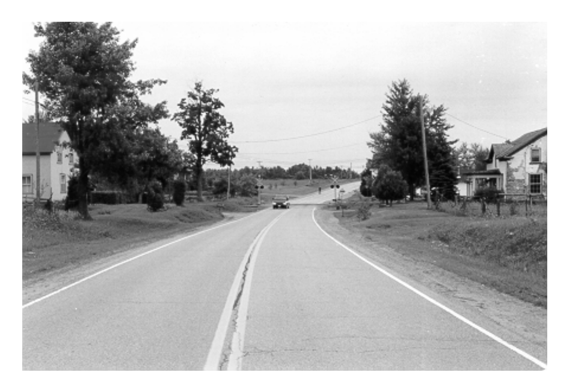
Figure 1 - Crossing at Mile 18.13 of the CPR Brockville Subdivision, facing east