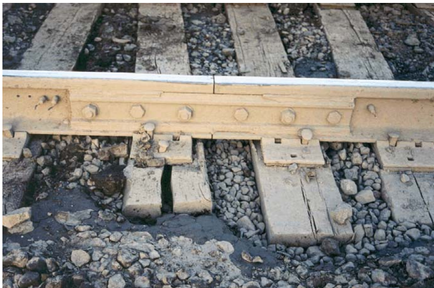
Photo 3. Close-up of joint north of Highway 12 crossing