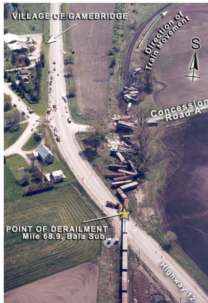
Photo 1. Aerial view of the derailment site, looking south

At about 1144 eastern daylight time, 1 while travelling at 59 mph with the throttle in the No. 5 position, an undesired emergency brake application (UDE) occurred. After conducting the necessary emergency procedures, the crew inspected the train and found that 49 cars, the 47th to the 95th behind the locomotives, had derailed and were piled up, immediately south of the Highway 12 crossing at Mile 68.9, in the village of Gamebridge, Ontario (see Photo 1). Some 1700 feet of track was destroyed, beginning at the south end of the Highway 12 crossing and extending southward through the crossing at Concession Road A.