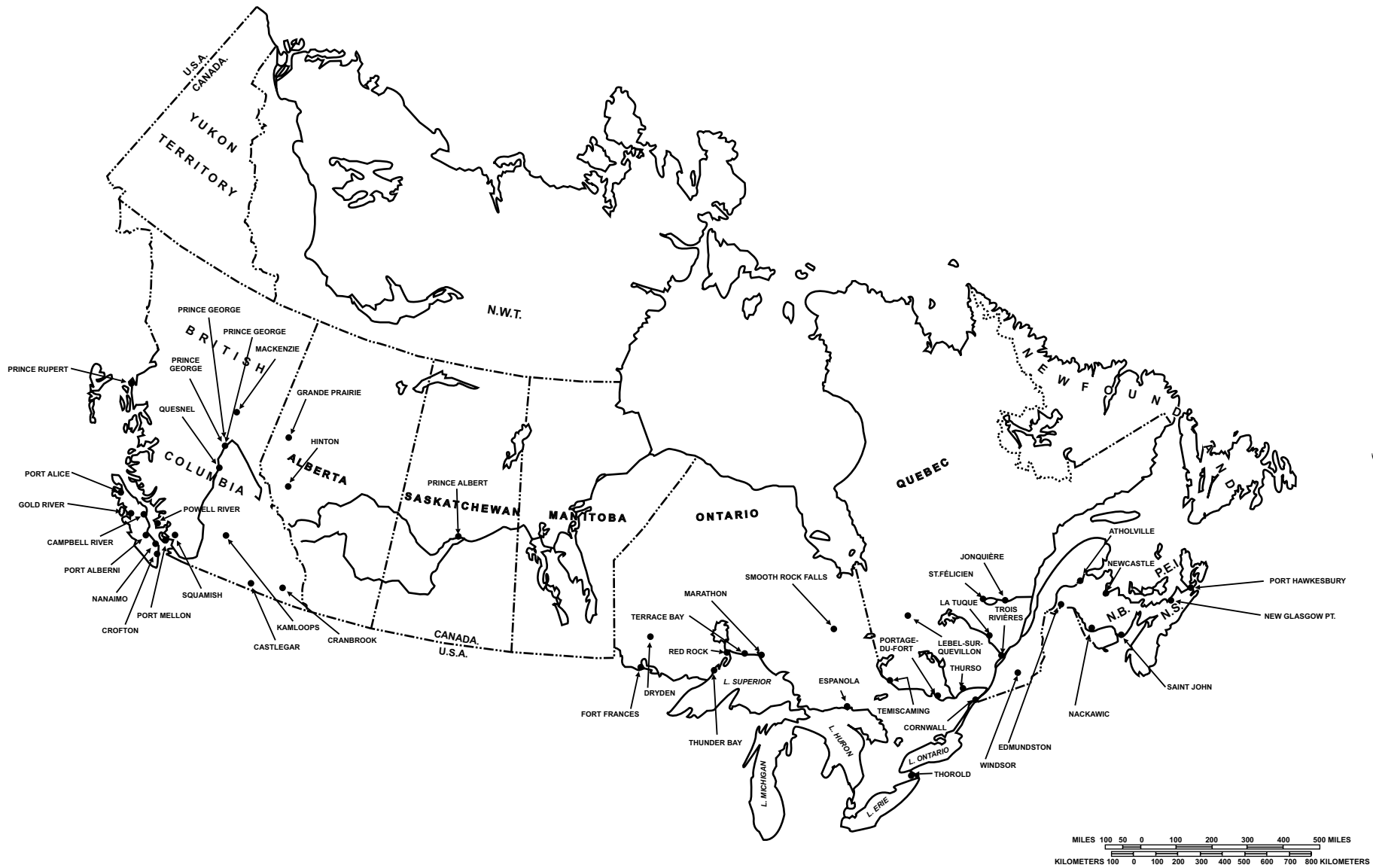
Figure 1 Locations of Canadian Pulp Mills Employing Chlorine Bleaching