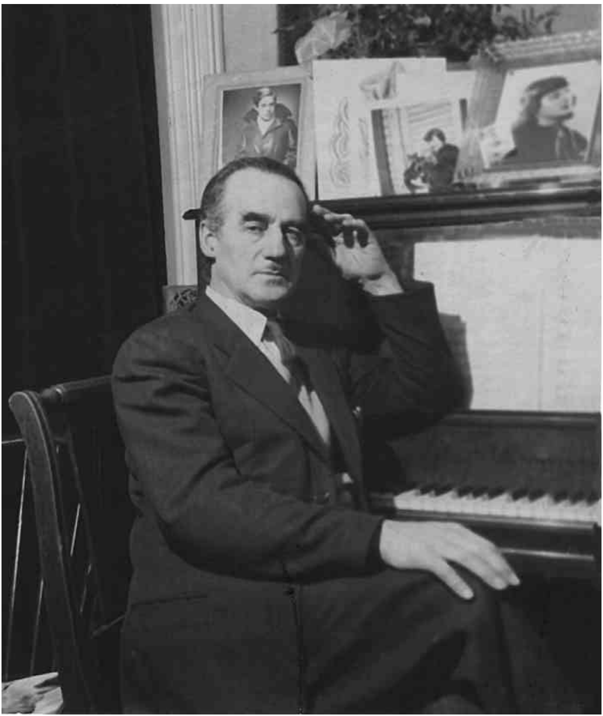
Rodolphe Mathieu, Montreal, [ca. 1950]. All rights reserved. Commercial reproduction is prohibited.