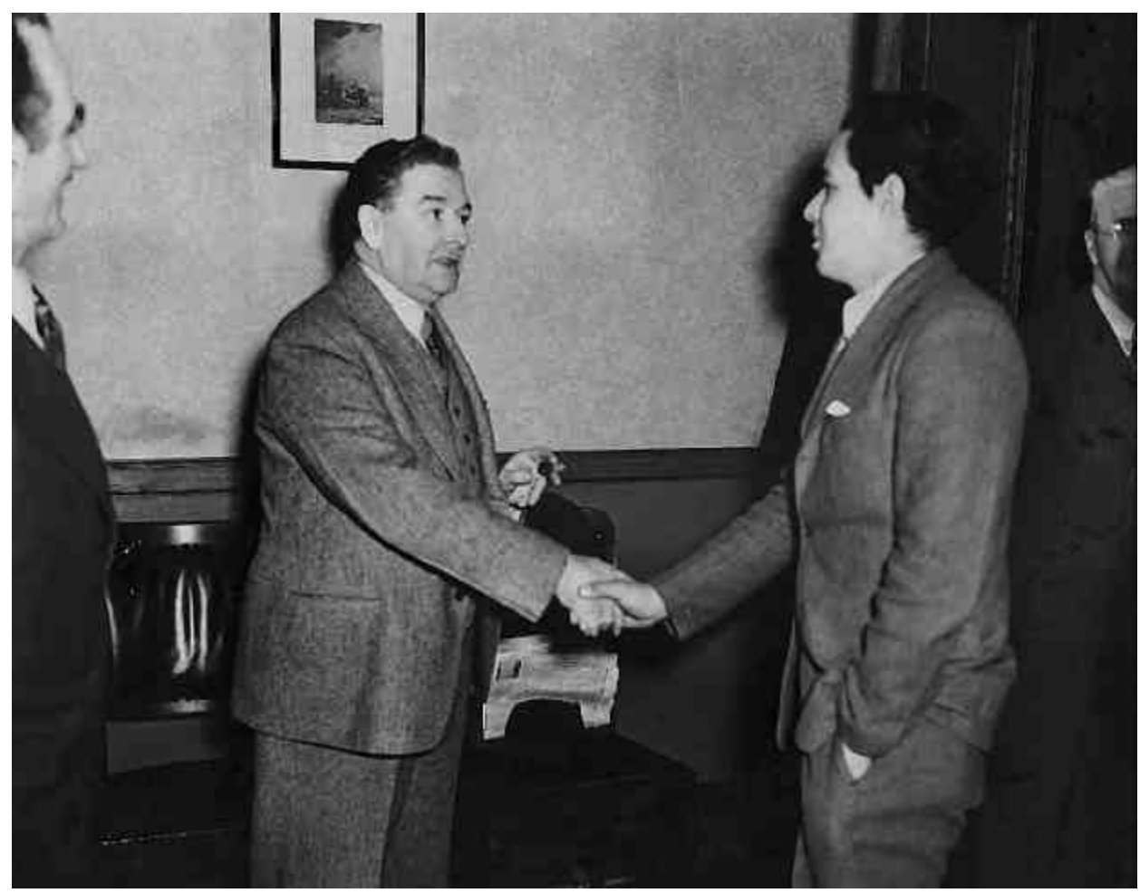
André Mathieu and the Quebec Premier Maurice Duplessis, [ca. 1946]. Photography: Service de ciné-photographie de la province de Québec. All rights reserved. Commercial reproduction is prohibited.

MUS 165/G,16 André Mathieu. – 1941-1949. – 33 photographs: b&w; 20.5 x 25.5 cm or smaller. File containing mainly photographs of André Mathieu with family members and friends. The file also contains two photographs of André Mathieu with Maurice Duplessis.