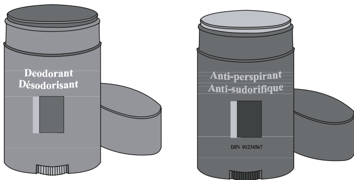
Cosmetic vs. Drug