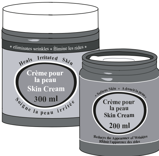
Unacceptable (left) vs. Acceptable Claims

Cosmetics can only make claims that are cosmetic in nature. A product possessing claims that are both therapeutic and cosmetic is therefore considered a drug, and must fulfill the requirements of the Food and Drugs Act and Food and Drug Regulations .